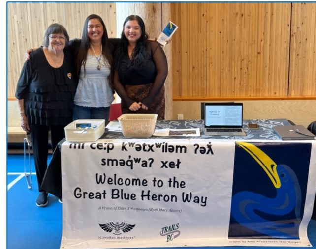
At the TFN Youth Job Fair