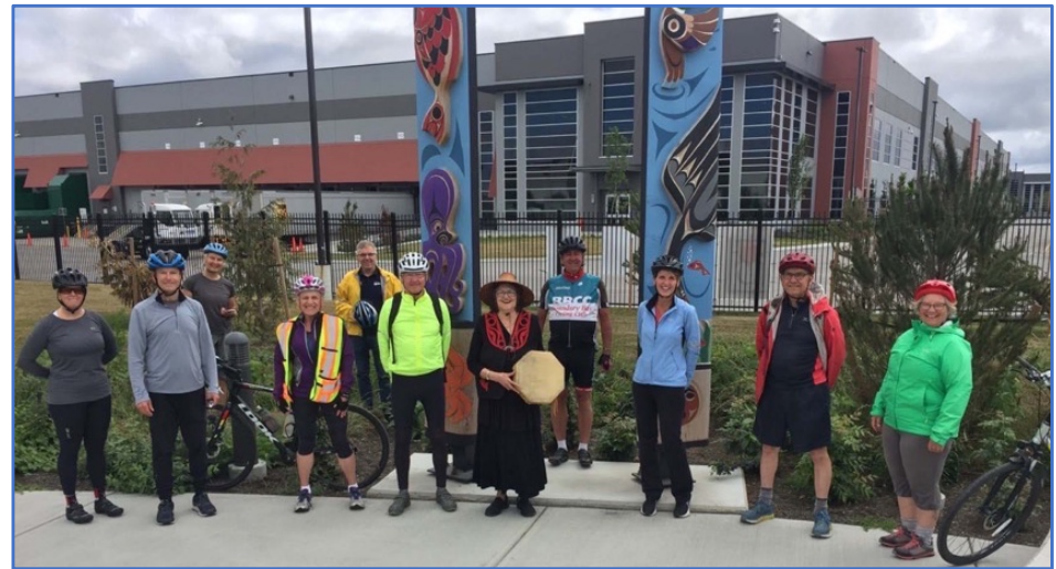
Start of bike tour, with Trails BC and HUB Cycling.

Working closely with supporting organizations