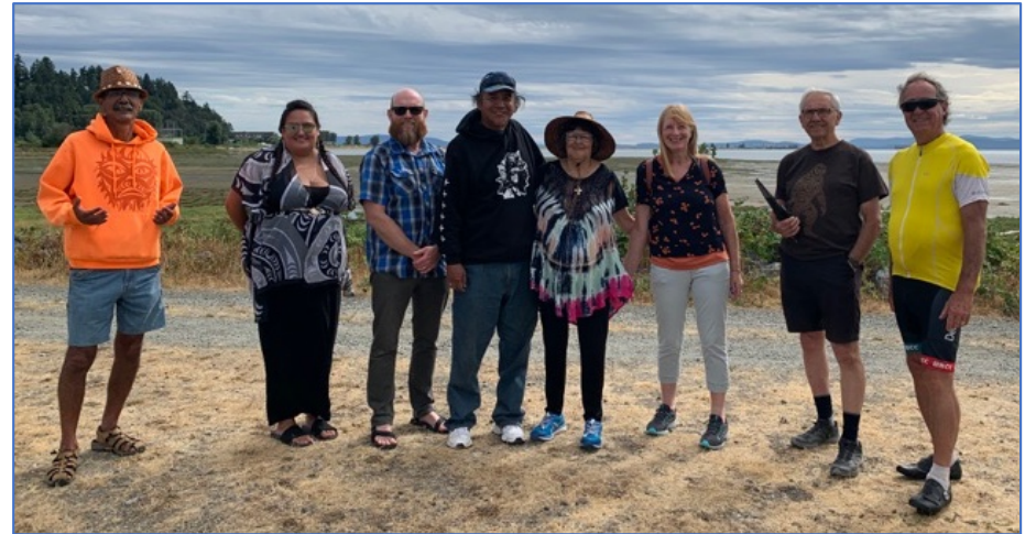
On the Great Blue Heron Way at TFN with Squamish Nation members and GBHW volunteer team members, 2021