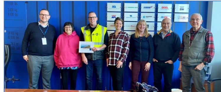
GBHW team members with supporters, Global Container Terminals