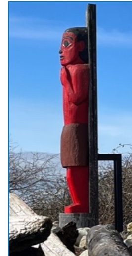
At the TFN member beach park, on the 'land facing the sea'