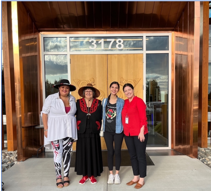
A GBHW presentation was made, by Grandmother and Granddaughter, to Tsleil-Waututh Chief and Council in June 2023