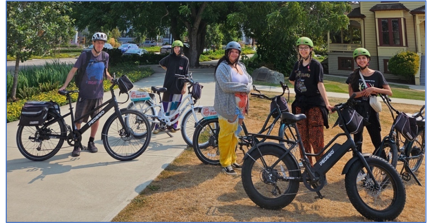
TFN Summer Youth Program - 2022 on TFN, and 2023 at Boundary Bay