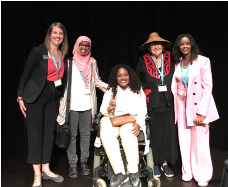
Inclusive Active Transportation panelists, 2019.

Regional GBHW presentations have taken place at: