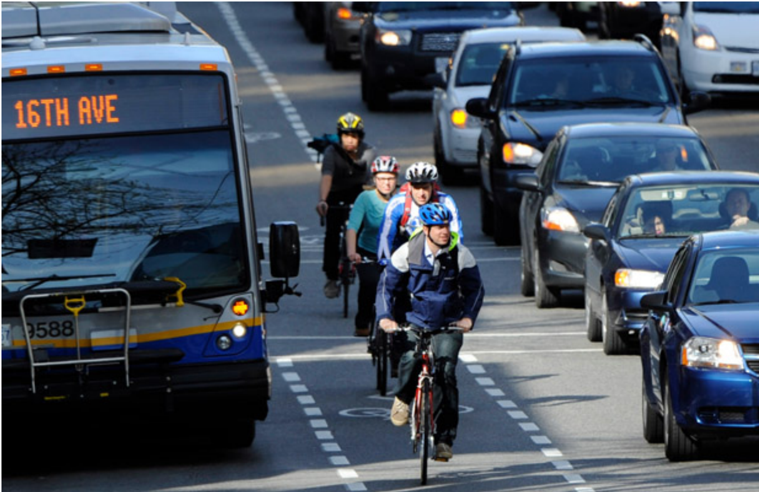
Burrard Street Bike Lane