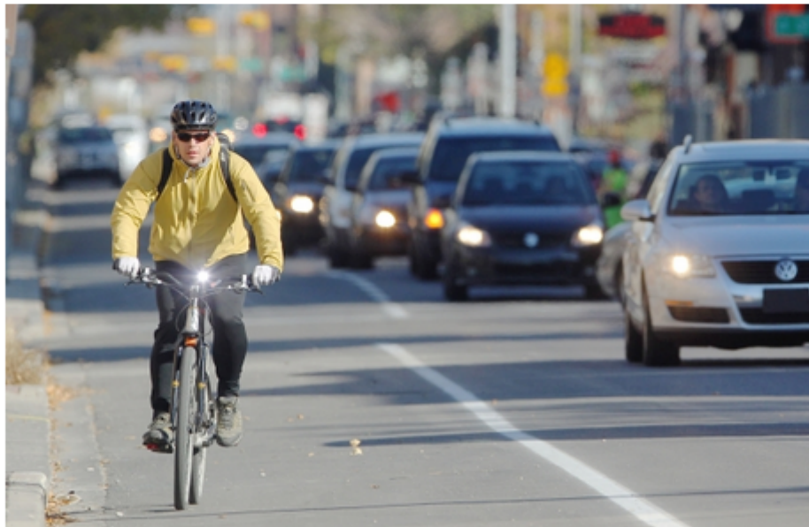
A cyclist makes his way along 10th Avenue S.W. during the afternoon rush hour. The City of Calgary is looking at creating segregated bike lanes downtown.