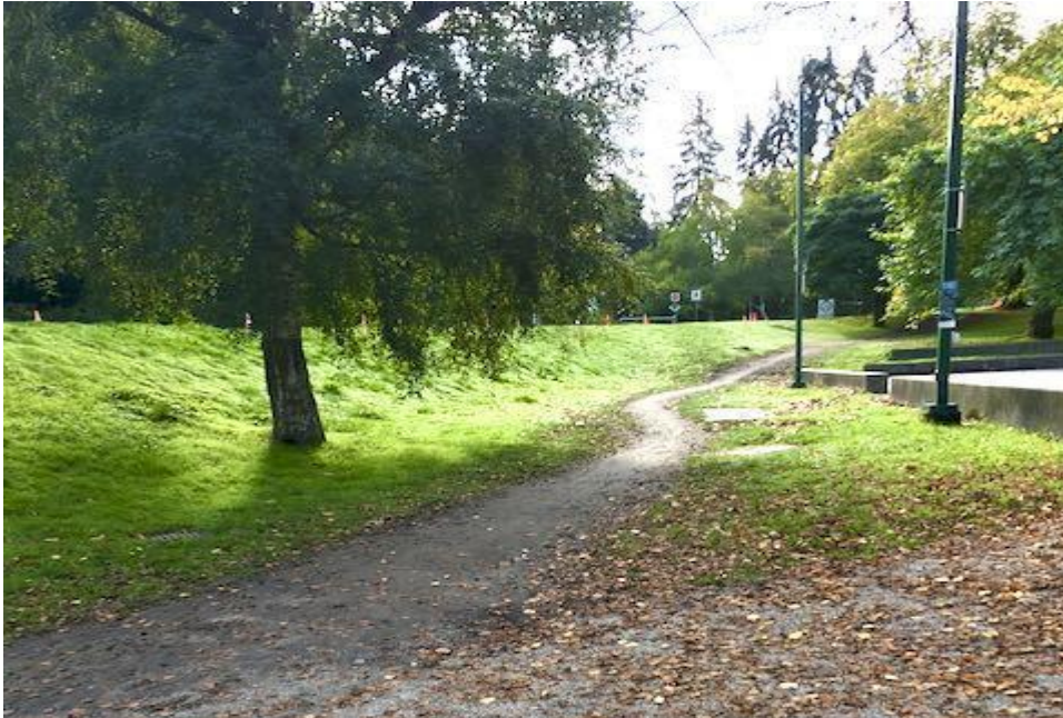
Figure 6 - Desire Line from Stanley Park Drive to the playground and Ceperley Tunnel

There is a desire line connecting Stanley Park Drive to the playground and Ceperley Tunnel, shown in Figure 6. Consideration should be given to paving this path.