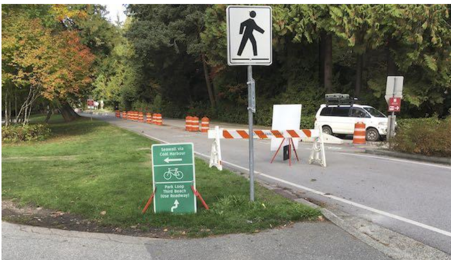
Figure 5 - Park Drive at North Lagoon Drive