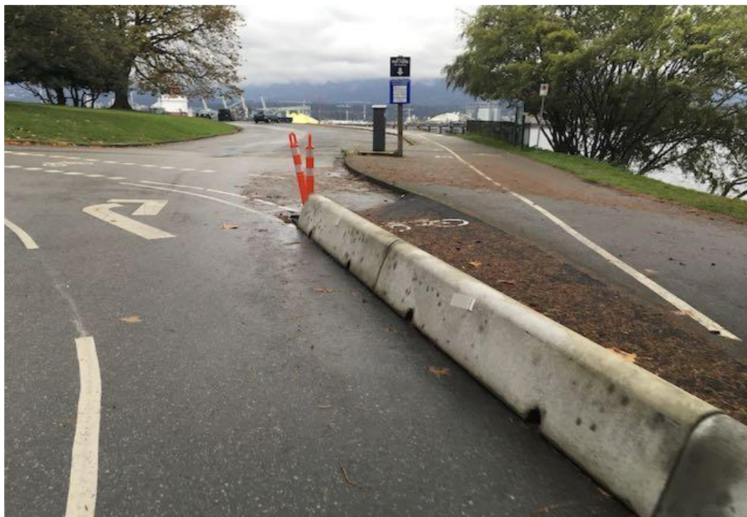
Figure 21 - Entrance to the Brockton Point parking lot

Those people cycling who chose to take the existing raised path are directed back onto the roadway where vehicles can be turning right into the parking lot, as shown in Figure 21.