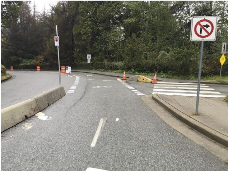
Figure 29 - Bike lane at the exit of the Prospect Point parking lot

The exit from the Prospect Point parking lot, shown in Figure 29, is a frequent conflict zone. Green paint should be used to indicate that people driving are crossing a cycle lane. The barriers installed to normalize the intersection geometry have been pushed back by vehicle operators, creating a slip lane. A concrete island should be installed on the left side of the bike lane to help people driving to do so safely when they are exiting the parking lot.