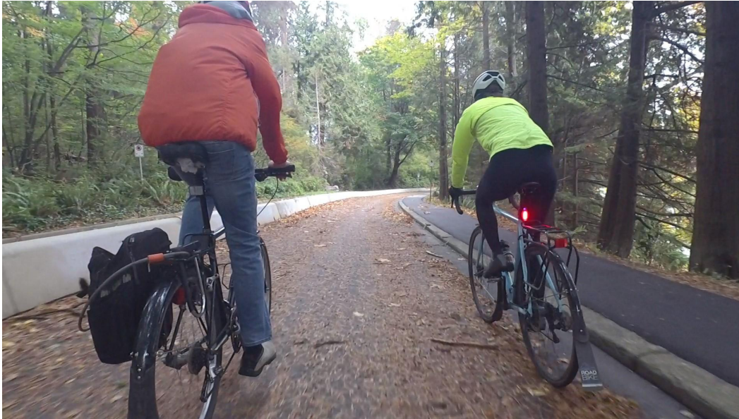
Figure 17 - Bike lane with debris

Leaves and other debris can make the bike path slippery and dangerous. This is illustrated in Figure 16. The route requires regular maintenance with sweepers, especially in the fall.