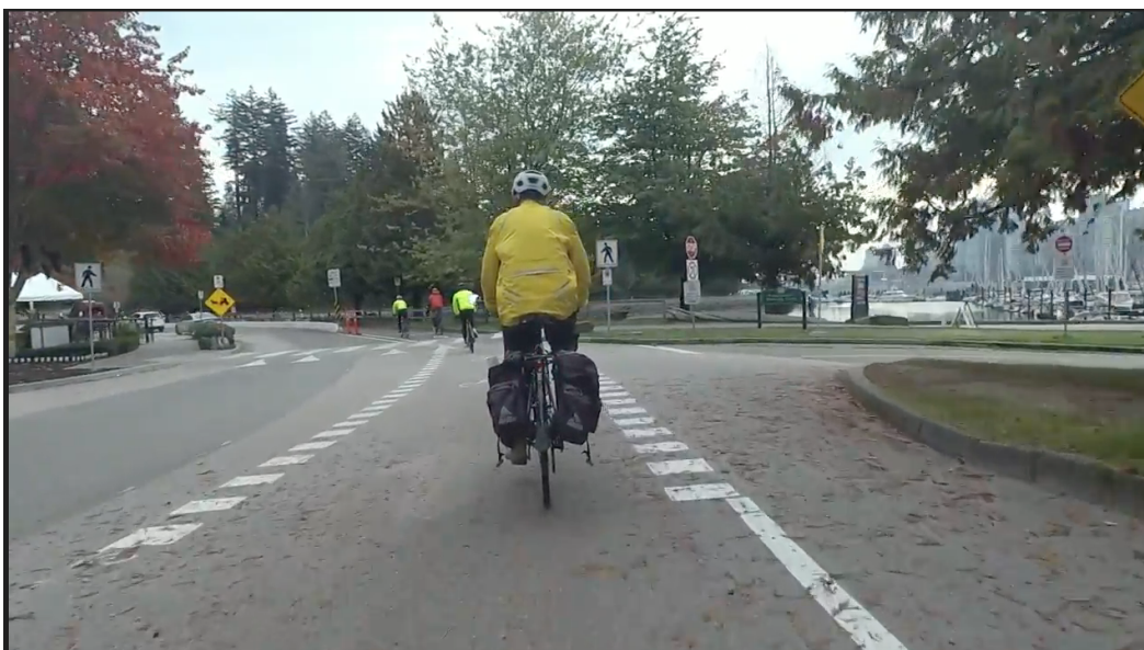
Figure 15 - Stanley Park Drive at the Information Booth

The protected cycling lane narrows significantly just before the Information Booth, as shown in Figure 15. This is understandable as it is a high traffic area for people walking, but it should be clearly signed to indicate that the lane narrows. As this is at the bottom of a small hill there are some path users moving more quickly here.