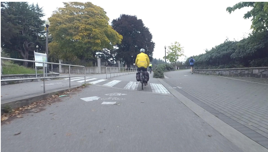
Figure 11 - Coal Harbour Entrance Hub

After going through the underpass, along the path to Coal Harbour shown in Figure 11, there is no indication that a sharp left must be taken to continue on to the temporary bike lanes on Park Drive. Instead, people cycling end up at the seawall at Coal Harbour. Signage and stencils would help. The current crosswalk marking does not show that cycling is permitted, despite the arrow stencil on the path.