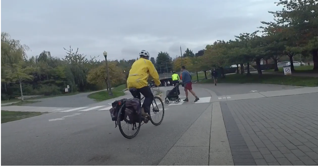
Figure 10 - Approaching Chilco Tunnel

Improved signage could reduce conflict between people walking and people cycling, as shown in Figure 10.