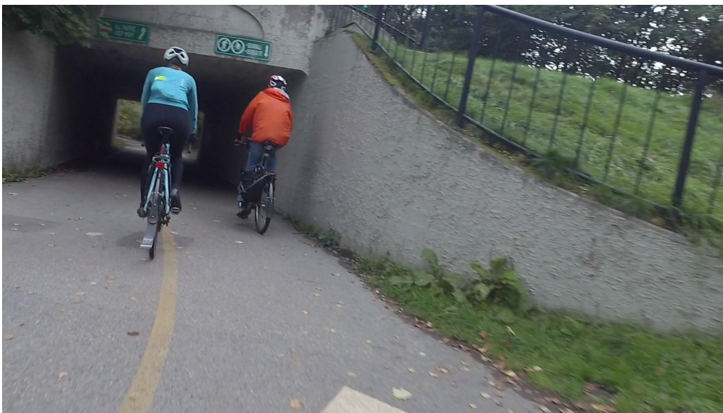
Figure 7 - Ceperley Tunnel

Ceperley Tunnel, shown in Figures 7, is narrow and it is often used by people walking