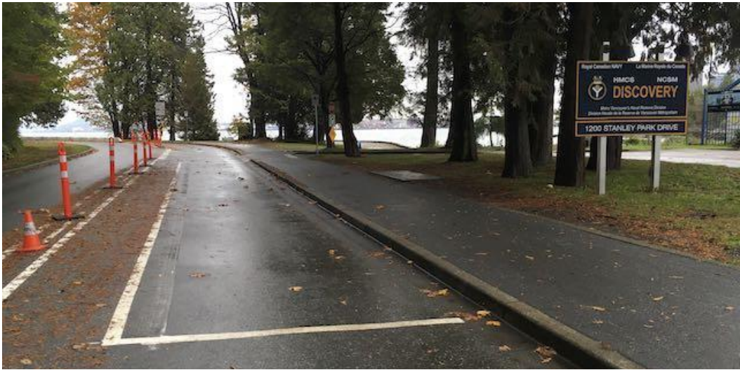
Figure 19 - Bike lane at the Royal Vancouver Yacht Club with Horse Carriage stop

There is a horse carriage stop placed in the bike lane, shown in Figure 19. This is unsafe for people cycling, and should be relocated out of the cycling lane.