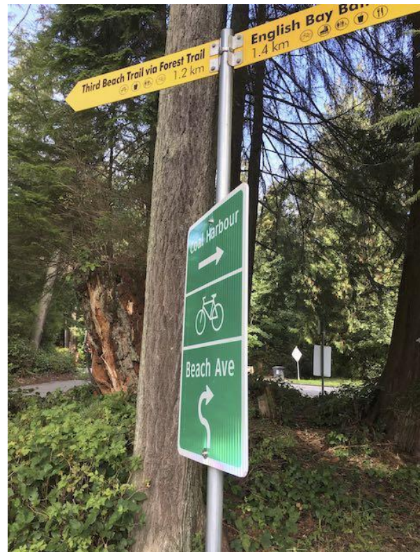
Figure 33 - Additional signage