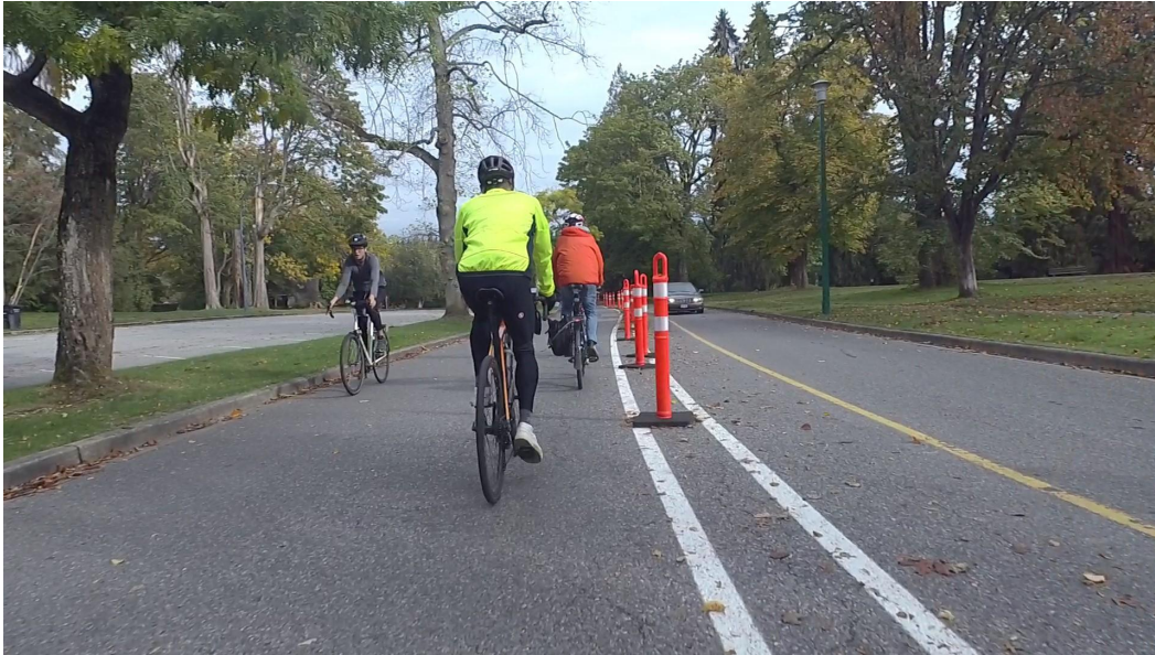
Figure 2 - Park Drive bidirectional lane from Park Lane to North Lagoon Drive

The cycling lane here, shown in Figure 2, is bidirectional and the section from Park Lane to north of the Lawn Bowling club should be wider, with a painted yellow centreline to emphasize that it is bidirectional.