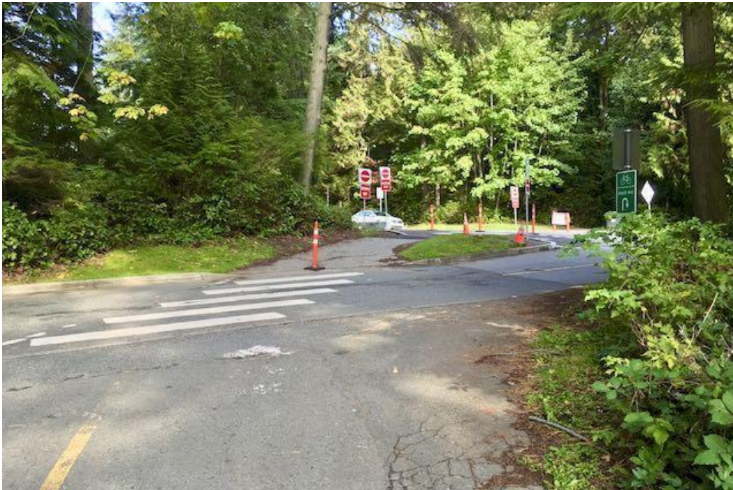
Figure 34 - Second Beach parking lot crossing