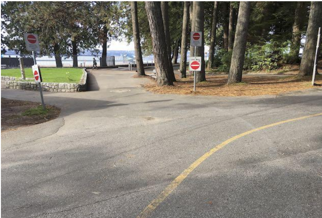
Figure 35- Signage at the exit of the seawall bike path