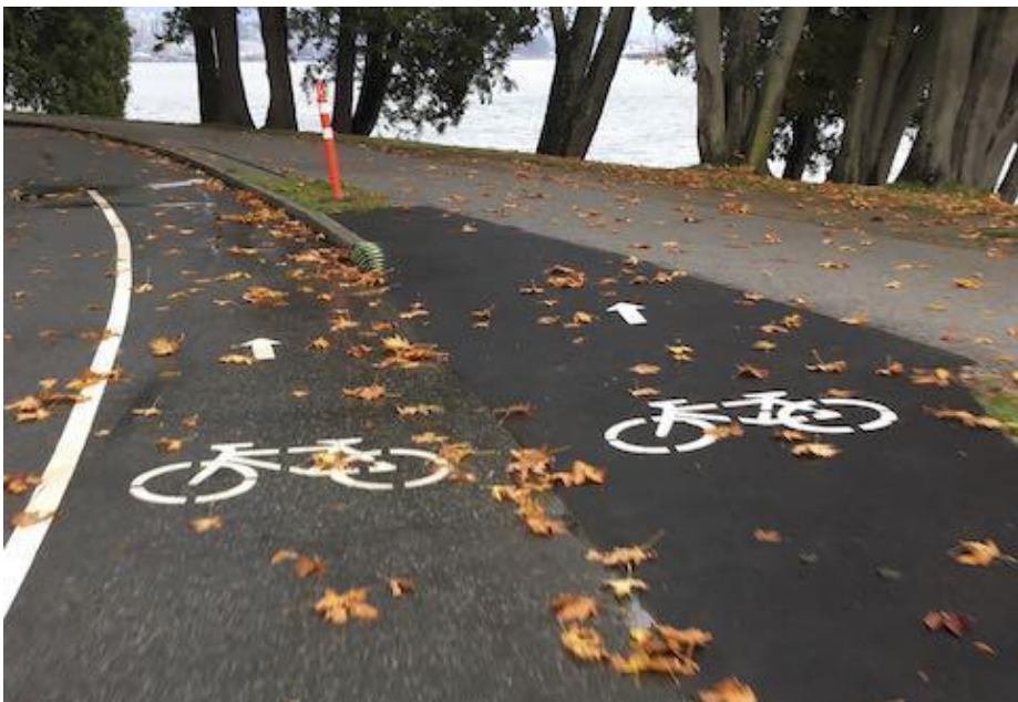
Figure 20 - Bike lane splits at the 9 O'Clock Gun

At the Harry Jerome statue, the bike lane merges with the vehicle lane. There is a single share the lane sign. This requires additional attention. Figure 20 shows a new ramp from the temporary route up to the existing seawall bike path. People cycling are given two options here, to share the road with vehicles or take the existing raised path, but this creates conflict with vehicle operators who squeeze past, apparently believing that people cycling should not be on the roadway here.