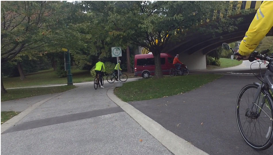
Figure 14 - Connecting path from the Coal Harbour Entrance Hub at Stanley Park Drive

At the north end of the connecting bike path to Stanley Park Drive, shown in Figure 14, there is an unmarked hard right turn to get back on the protected paths.