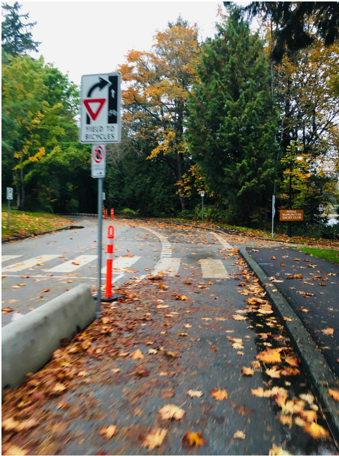
Figure 16 - Bike lane at the Royal Vancouver Yacht Club

There are two vehicle crossings of the bike lane at the Royal Vancouver Yacht Club, with one shown in Figure 16. Both crossings should be marked with green paint to indicate conflict zones.