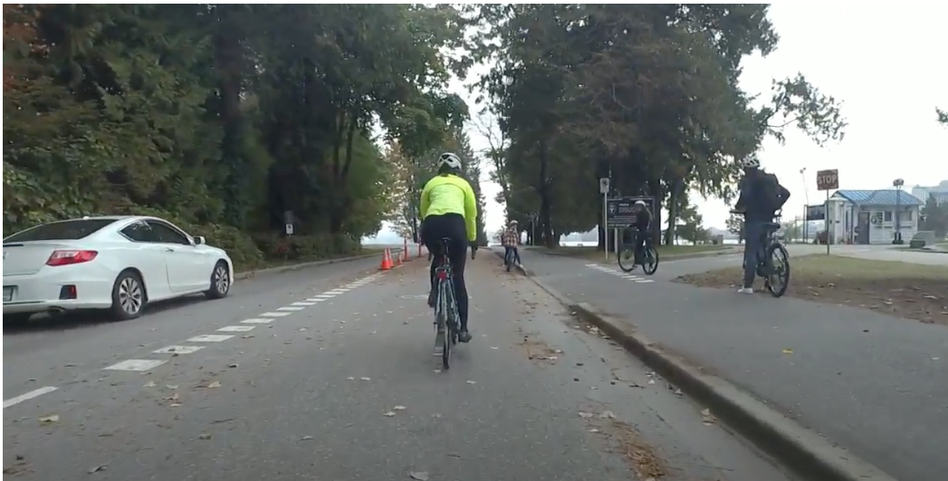
Figure 18 - Bike lane at HMCS Discovery

Where the seawall route and the temporary cycling lanes converge at HMCS Discovery, shown in Figure 18, people cycling can be confused as to where to ride, and seawall path users were observed inadvertently entering the temporary lanes on the roadway.