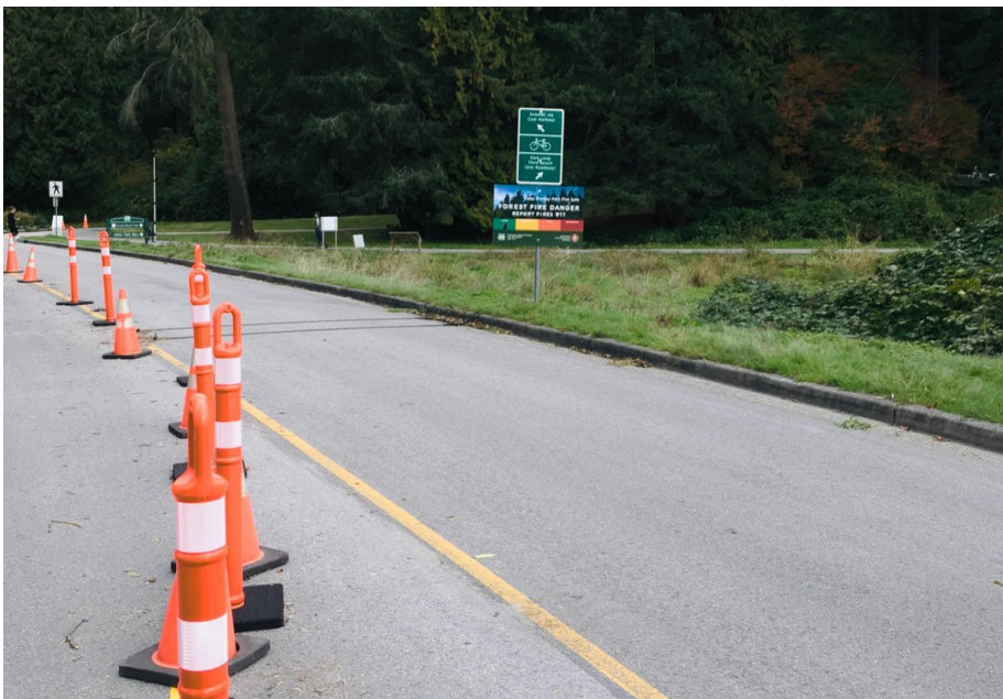
Figure 4 - Park Drive at North Lagoon Drive

Anecdotally, an approximate 50:50 split was observed on the day of our assessment ride, between people cycling on the temporary route and N. Lagoon Drive.