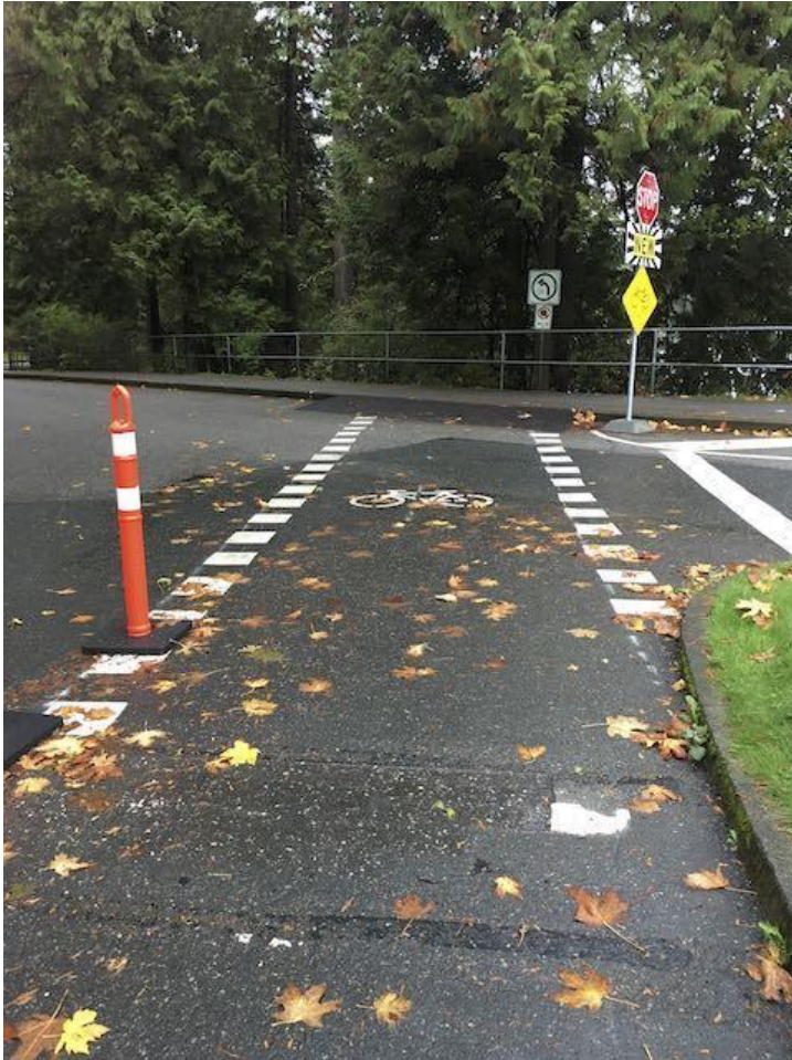
Figure 23 - Exit from the Brockton Point parking lot, with a new cycling ramp

At the exit of the Brockton Point parking area there is another ramp taking people cycling back up to the existing raised path, shown in Figure 23. This is not clearly signed. Many people cycling will choose to stay on the roadway here instead of riding on what appears to be a sidewalk, and not switch back and forth between the roadway and the raised path.