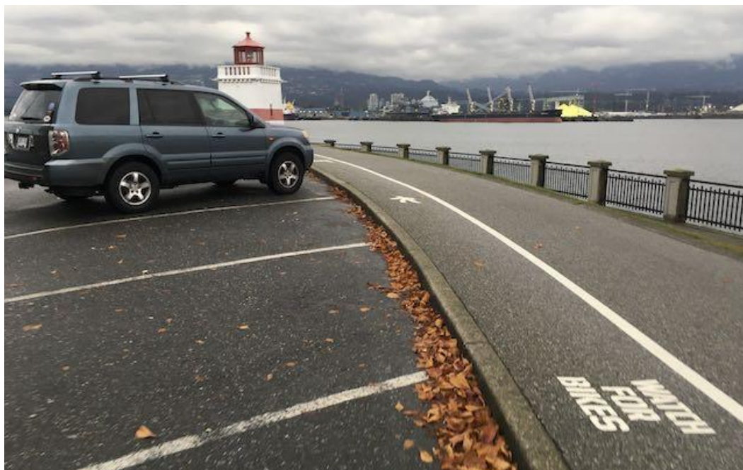
Figure 22 - The Brockton Point parking lot showing the narrow bike path

The existing seawall path, shown in Figure 22, is very narrow and runs in front of parked vehicles, in the area where people are standing, and exiting and entering their vehicles. This is a high conflict zone.