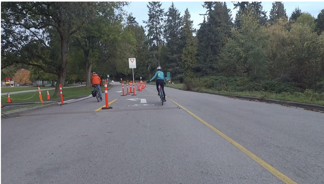
Figure 3 - Turn from Park Drive at Ceperley Park to the new connecting path to the South Lagoon route

The turn-off Park Drive to the new connecting path to the South Lagoon path, shown below in Figure 3, can be confusing to path users.