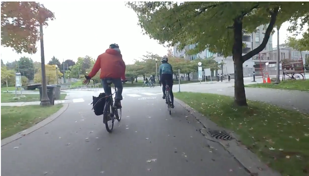
Figure 9 - South Lagoon Path

At the end of the South Lagoon path, approaching the underpass at Chilco and Georgia, as shown in Figure 9, the path directionality is confusing and it appears that people cycling should stay to the left of the guard rail. Stencils and signs would help. This is also a heavy traffic area for people both walking and cycling. This will also be the location of upcoming construction work by Metro Vancouver for the water supply tunnel, and additional attention should be paid to signs when the tunnel shaft construction detour is in place.