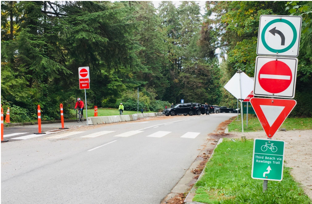
Figure 36 - Signage at the exit of the protected bike path from Prospect Point, directing people to Rawlings Trail

The sign for the trail route to 3rd Beach, shown in Figure 36, is positioned on the road and not where cyclists are, on the path to the left.