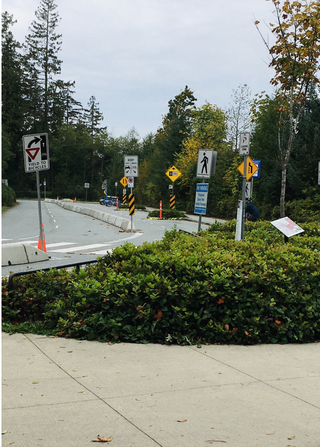
Figure 27 - Bike and vehicle lanes, with parking lot entrance, at Prospect Point