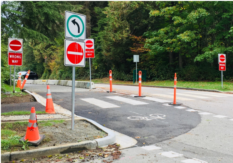
Figure 31 - Signage at the exit of the protected bike path from Prospect Point

The area around North Lagoon Drive, Stanley Park Drive, the exit of the seawall bike path near the concession, the access to Rawlings Trail, and the access to the South Lagoon bike path is very confusing for users. There are a lot of signs, shown in Figures 31 to 36, but they do not appear to deliver a consistent message.