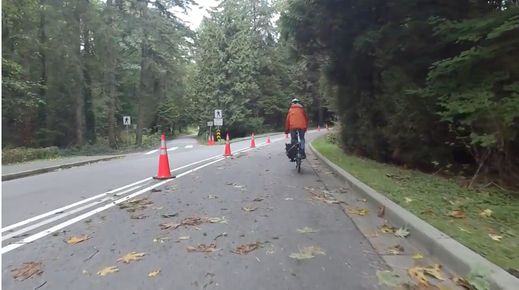
Figure 26 - Cone-protected bike lane at the Prospect Point Hill

The well-spaced cones that are along here, shown in Figure 26, make it easy for people cycling more quickly to overtake slower riders. The cones have been shifted at the hairpin turn, likely after being hit by vehicles. On the hill, we observed that slower riders stayed to the right side for the most part. This section should have concrete dividers, but with openings to allow changing lanes for overtaking.