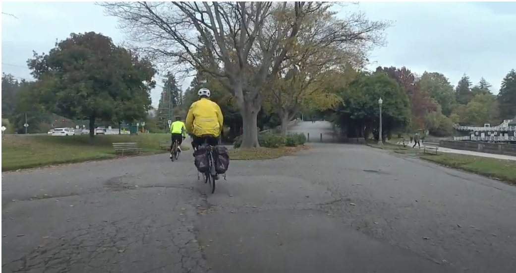
Figure 12 - Connecting from the Coal Harbour Entrance Hub to the protected bike lanes

There are few markings on the connecting path shown in Figure 12, running from the Coal Harbour Entrance Hub towards both the Causeway paths and the protected cycling lanes on Park Drive. The pavement along here is very wide, and could easily have a painted cycling lane along the west side, for the comfort and safety of people walking as well as people cycling.