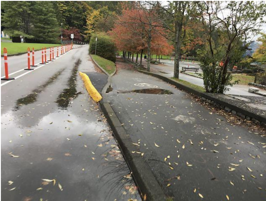
Figure 24 - Ramp from the existing raised bike path at Lumberman's Arch

The ramp back down to the protected lane on the roadway near the water park, shown in Figure 24, needs improved markings. There are also problems with water drainage on the roadway here.