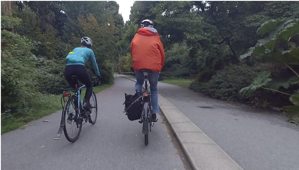
Figure 8 - Bike path from Ceperley Tunnel to Lost Lagoon

The cycling path east of Ceperley Tunnel, shown in Figure 8, is not sufficiently wide, and lacks stencils or markings to indicate where people should cycle, and where people should walk.