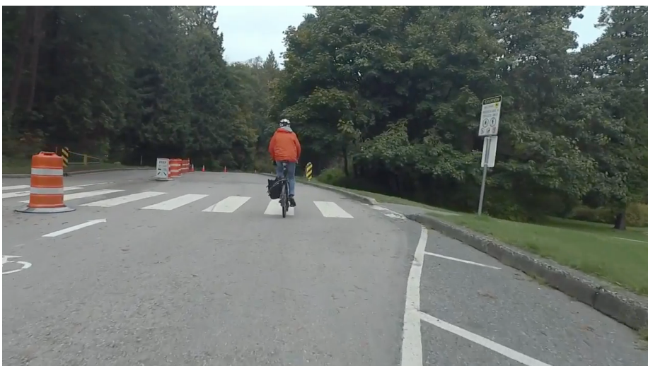
Figure 25 - Protected bike lane at access path to seawall to avoid the Prospect Point hill

This section works well. The lane back down to the seawall at the north foot of the Prospect Point hill, shown in Figure 25, should be better marked, especially to assist those people cycling who wish to avoid the hill. Clearer signage should be erected to indicate to path users that they can return to the park entrance along Pipeline Road, thus avoiding the hill.