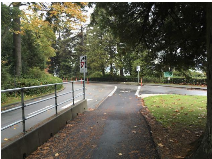
Figure 30 - Parking lot entrance at Ferguson Point

At Ferguson Point, the parking lot entrance relocation has been successful, with the closure of the first access eliminating a significant conflict zone for people cycling. The new turn into the parking lot, shown in Figure 30, should be demarcated with green paint. We have heard requests for additional signage from those using Rawlings Trail to access the beach here.