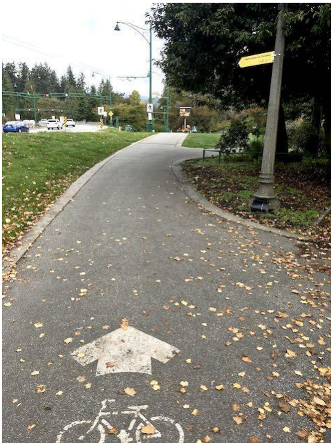
Figure 13 - Connecting from the Coal Harbour Entrance Hub to the protected bike lanes

The stencils that do exist, shown in Figure 13, direct people cycling towards the Causeway bike paths, which is good, but not also to the protected lanes on Park Drive, which should be remedied.