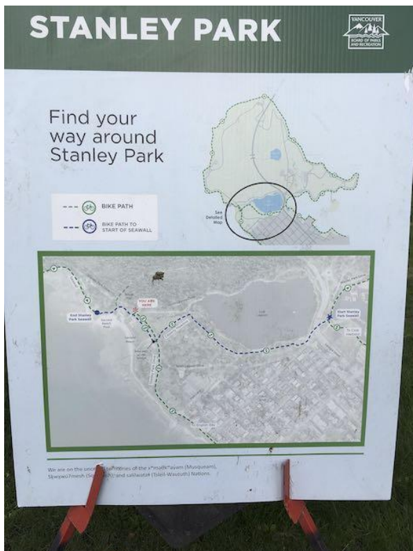
Figure 32 - Temporary signage