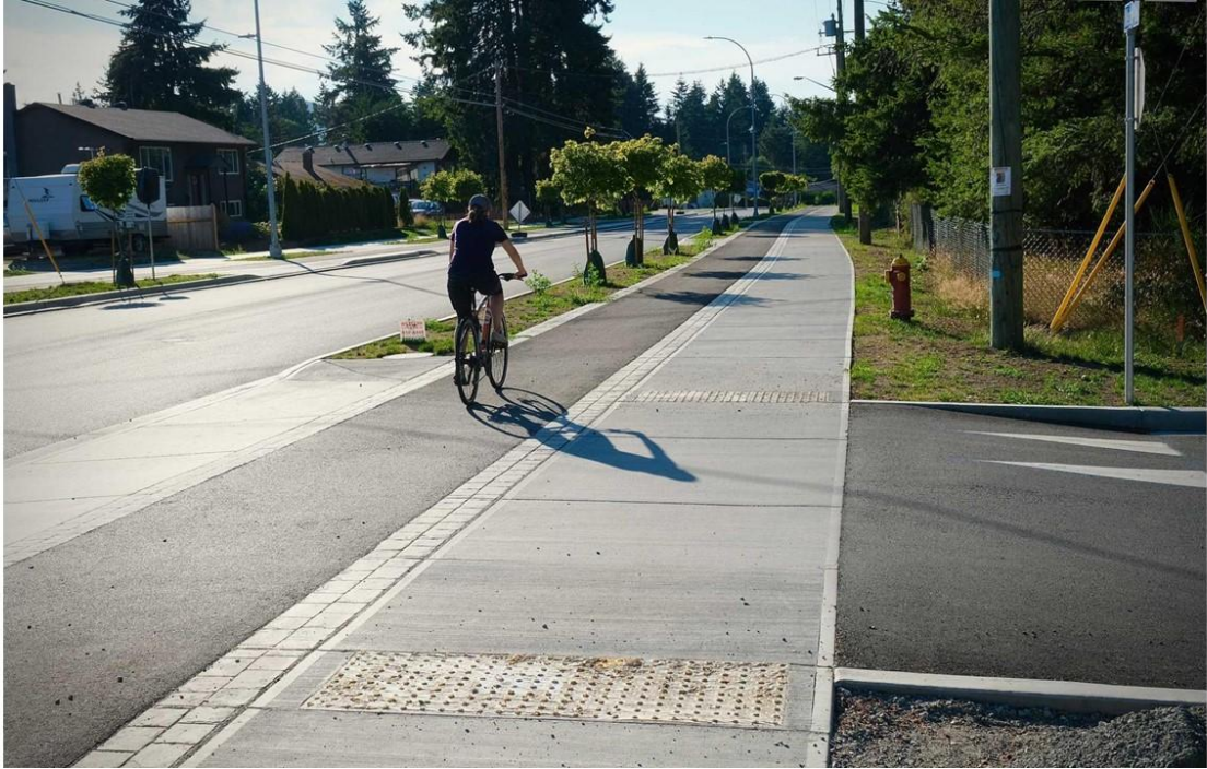
Raised greenway design