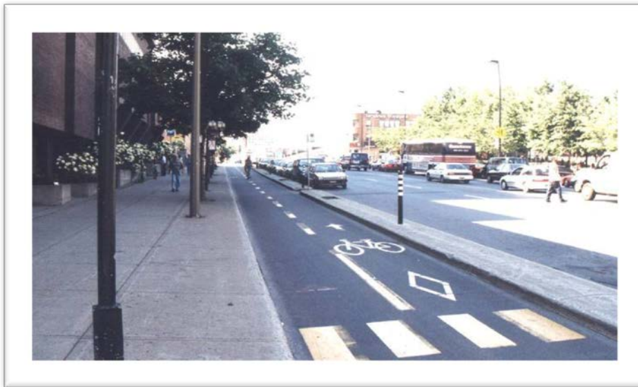
Figure 2. Example of a physical barrier that does not prevent emergency vehicle access

The current design calls for a 2 m wide at-grade cycling lane. To improve safety, this design should incorporate physical barriers between cyclists and vehicular flow. Permanent barriers are preferred over painted lines. There are barriers that provide a visual cue and physical deterrent that discourage vehicles from penetrating into cycling lanes and at the same time allow emergency vehicle access, which was the main reason given to VACC by the project team for not considering physical barriers. See Figures 2 and 3 below for examples of this kind of barrier.