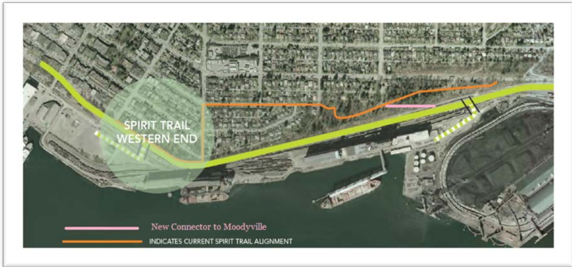
Figure 6. New Connector to Spirit Trail in Moodyville

We thank Port Metro and the City of North Vancouver for continuing this dialogue with the VACC and for hosting the stakeholder and public meetings in order to gather our feedback to the Gateway plan improvements to the Low Level Road in the North Shore Trade Area.