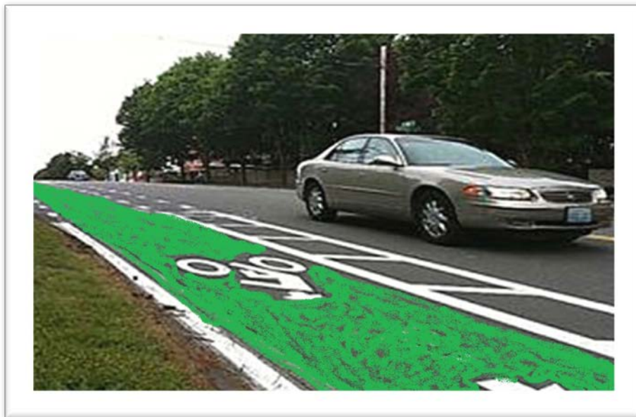
Figure 4. Separation Stripe and Green Lane

If separation barriers are not feasible, then a separation strip and a green lane would be preferable to a 200mm painted white line. (see Figure. 4 below)