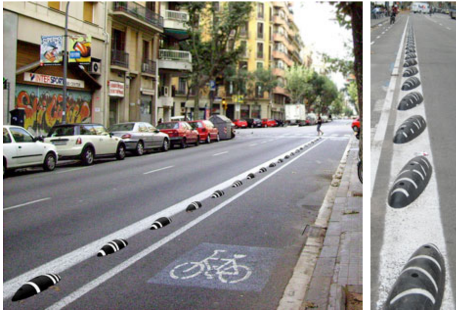
Figure 3. Example of a physical barrier that does not prevent emergency vehicle access

Another objection to separation barriers is that separate maintenance equipment and person hours will require funding. If existing equipment cannot be used and more maintenance would be incurred and that is the only thing that makes the separation barrier impractical, we suggest the three North Shore municipalities jointly purchase and operate a compact maintenance vehicle that would work for smaller areas such as sidewalks, separated bike lanes and the Spirit Trail. Does the City plan to have no separated bike lanes on the basis of maintenance costs?