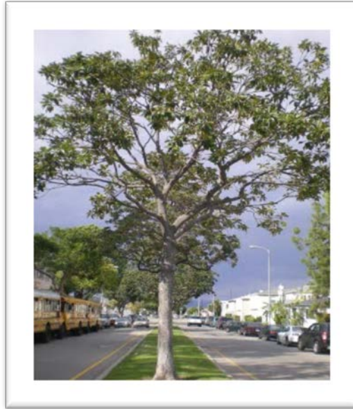
Figure 5. Trees or low growing shrubs can offer a natural separation barrier