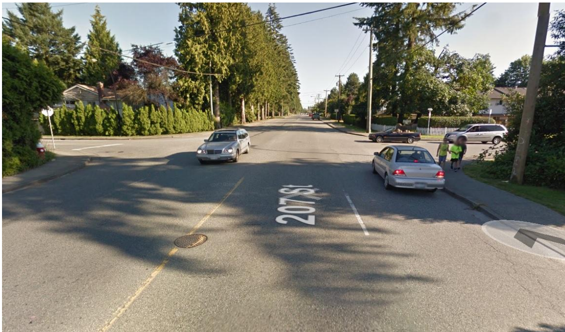
207 Street southbound at 118 Ave.

Between Lougheed Highway and Dewdney Trunk Road: