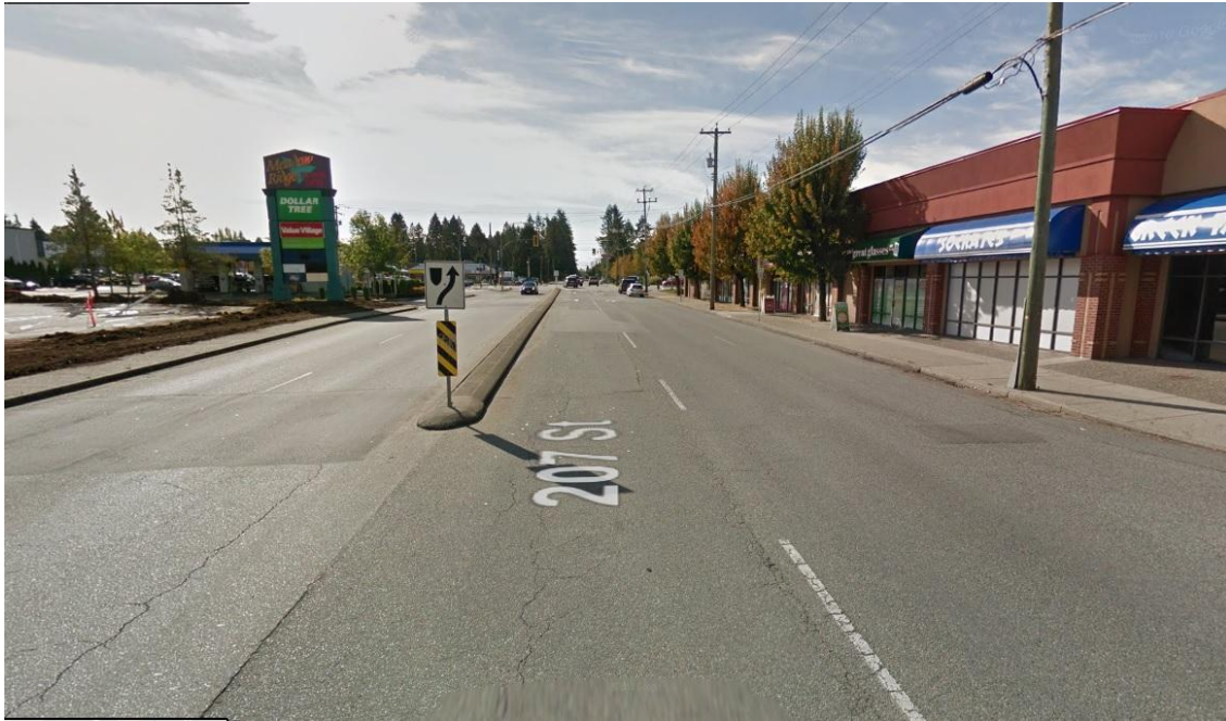
207 Street southbound at 119 Ave