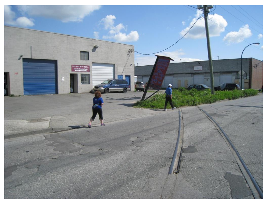
Figure 11 - Abandoned railway tracks are particularly dangerous when the tracks cross the roadway at oblique angles that can catch a bicycle wheel and create a risk of falling into vehicle traffic.