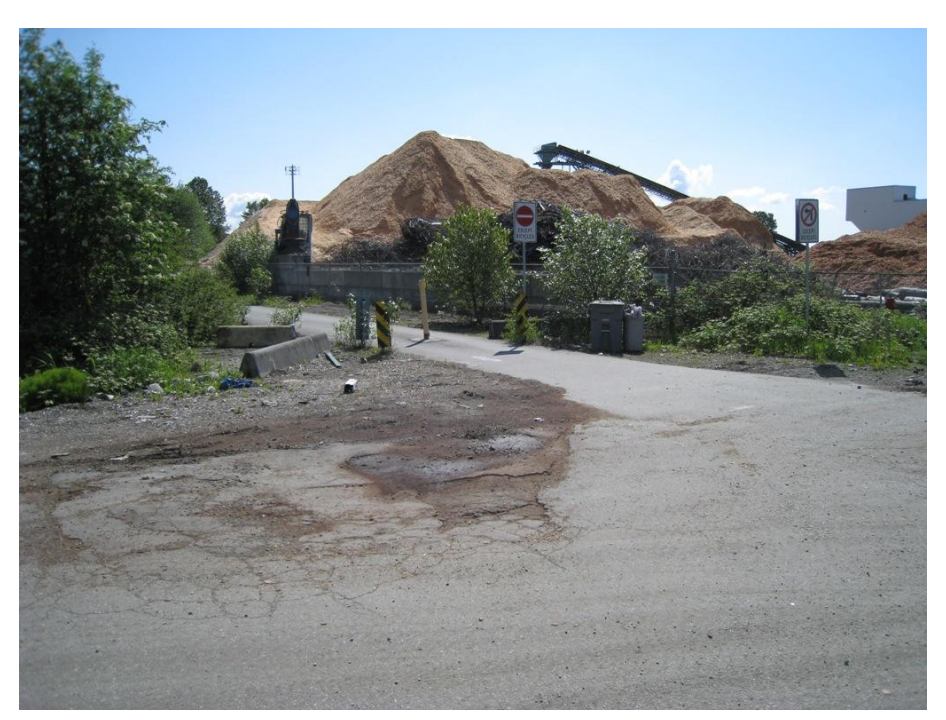
Figure 12 - The entrances to and exits from the current separated cycle paths along the Kent AVe South ROW require wayfinding signage to direct people on bikes. The route is not intuitive here.