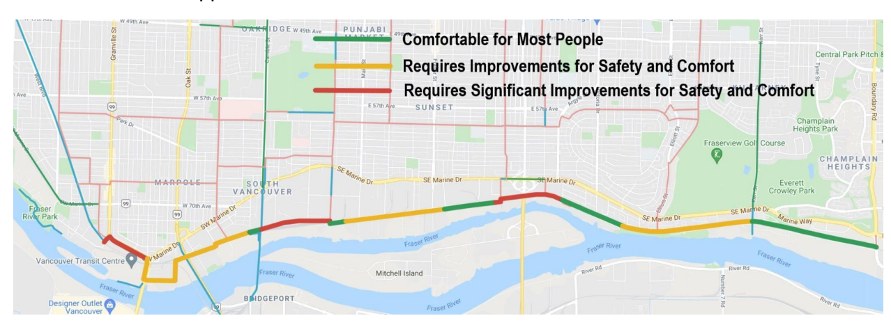
Figure 4 - HUB Cycling Kent Ave Assessment Ride results

Volunteer members of HUB Cycling's Vancouver Local Committee have conducted multiple assessment rides along the Kent Ave route. This resulted in an evaluation of the route to one of three levels, as shown in Figure 4. The issues with the sections in amber relate to unmaintained road markings and pavement; posted speed limits; high vehicle volumes; and abandoned railway tracks in the pavement. The sections in red are considered dangerous, due to a lack of any cycling infrastructure in places; a combination of a narrow roadway with no shoulder; high observed vehicle speeds; heavy truck traffic at times; and trucks observed to be using the current route as a loading/unloading zone. A more detailed assessment of the current route is included in Appendix 1.