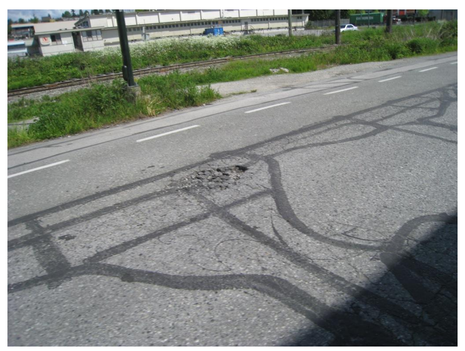
Figure 10 - Poor quality pavement exists in many sections, particularly along the edges of the roadway where people on bikes usually travel.