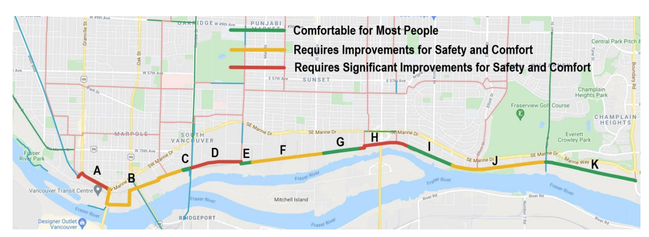
Figure 5 - HUB Cycling Kent Ave Assessment Ride results with route sections labelled