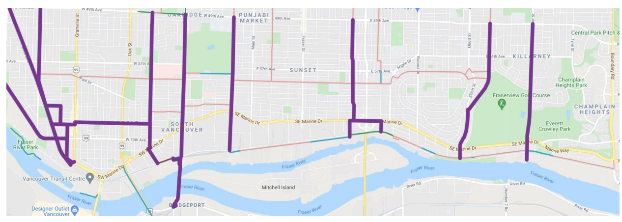
Figure 2 - Existing Vancouver north-south cycling routes that would be connected by the Kent Avenue Bikeway

Marine Drive represents the primary east/west vehicle route in this area, but is not suitable for cycling due to both high motor vehicle traffic volumes and high vehicle travel speeds. Marine Drive experiences daily traffic volumes in excess 70,000 vehicles per day³, compared to over 8,000 vehicles on Kent Ave⁴. Kent Ave also benefits from being flat, and thus attractive to people cycling of all ages and abilities, due to its proximity to the Fraser River. This route has been included in the HUB Cycling #UnGapTheMap campaign⁵ due to its regional significance.