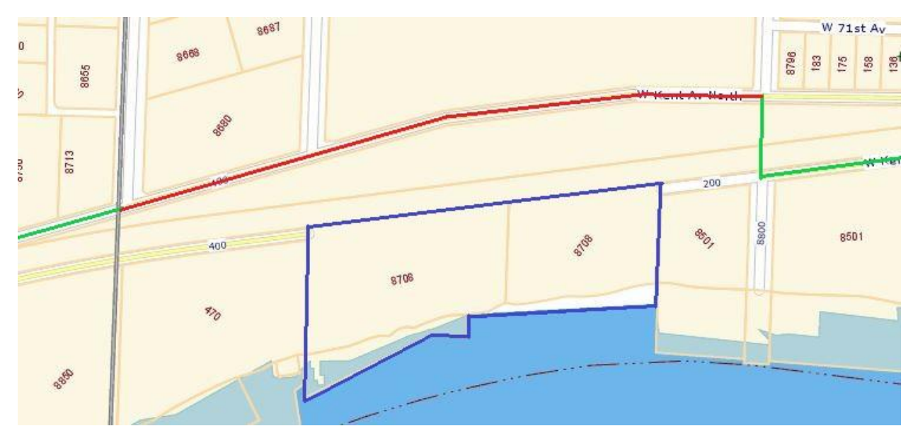
Figure 6 - The Kent Ave South alignment is blocked by private properties near Ontario (section D)

continuous, being bisected by several private properties where the public road right of way was sold off years ago. The most notable of these are the industrial millyards located between Ontario St and Cambie St, section D (also shown in Figure 6, with property lines in blue). The same situation exists with three properties located under the Knight St Bridge, section H (also shown in Figure 7, with property lines in blue).