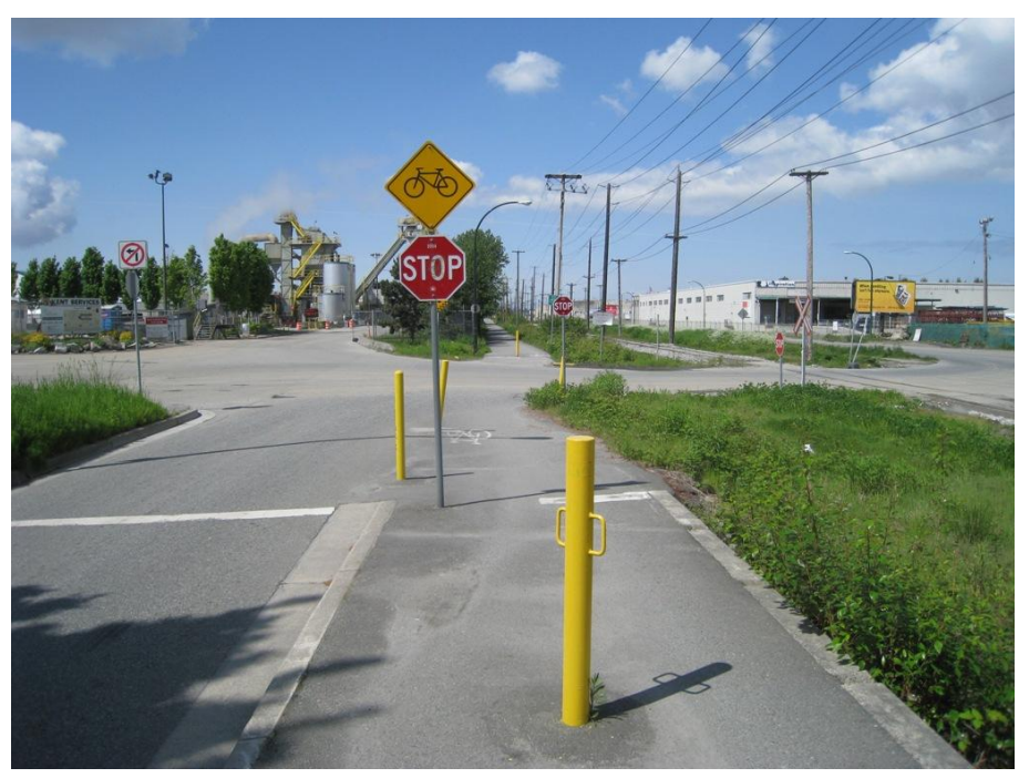
Figure 13 - Bollards are not well places and create a crash hazard, particularly at night. Concrete barriers would provide additional protection from motor vehicles after the first stop sign, to the intersection.