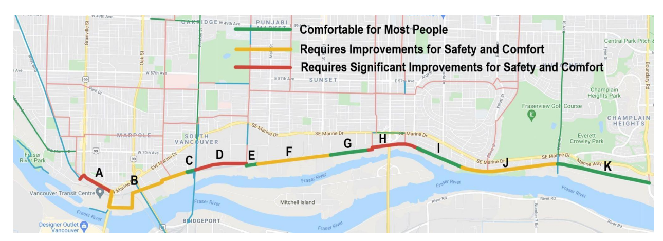
Figure 5 (figure duplicated here for reference)

HUB Cycling has 10 specific recommendations for improving the Kent Ave route. Locations for recommendations along this route are referenced in Figure 5, reproduced below.