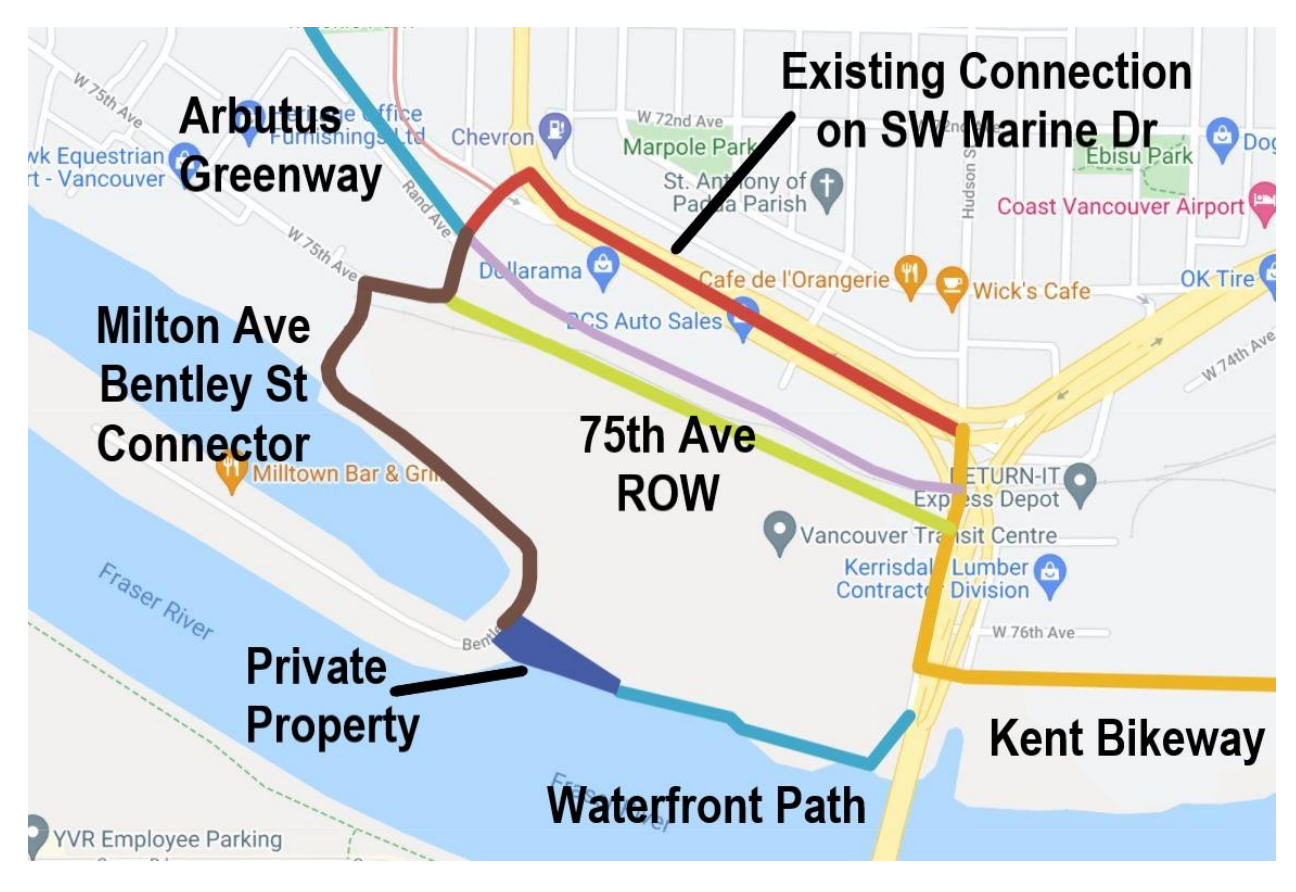
Figure 8 - The Arbutus Greenway, the westward extension of the Kent Ave Bikeway (on 77th Ave) and potential connections