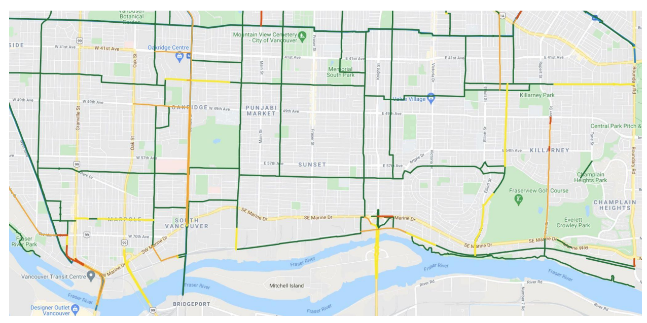
Figure 1 - HUB Cycling State of Cycling assessment of the Kent Ave area, and alternate routes on 37<sup>th</sup>, 45<sup>th</sup>, 57<sup>th</sup>, and 68<sup>th</sup>, with colour coding representing the degree of comfort and safety for most people cycling

Marine Drive represents the primary east/west vehicle route in this area, but is not suitable for cycling due to both high motor vehicle traffic volumes and high vehicle travel speeds. Marine Drive experiences daily traffic volumes in excess 70,000 vehicles per day³, compared to over 8,000 vehicles on Kent Ave⁴. Kent Ave also benefits from being flat, and thus attractive to people cycling of all ages and abilities, due to its proximity to the Fraser River. This route has been included in the HUB Cycling #UnGapTheMap campaign⁵ due to its regional significance.