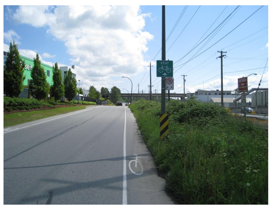
Figure 14 - The existing shoulder bicycle lane along Kent Ave. North near the Knight Street Bridge is not wide enough for a standard bicycle stencil, let alone comfortable and safe for most people cycling.