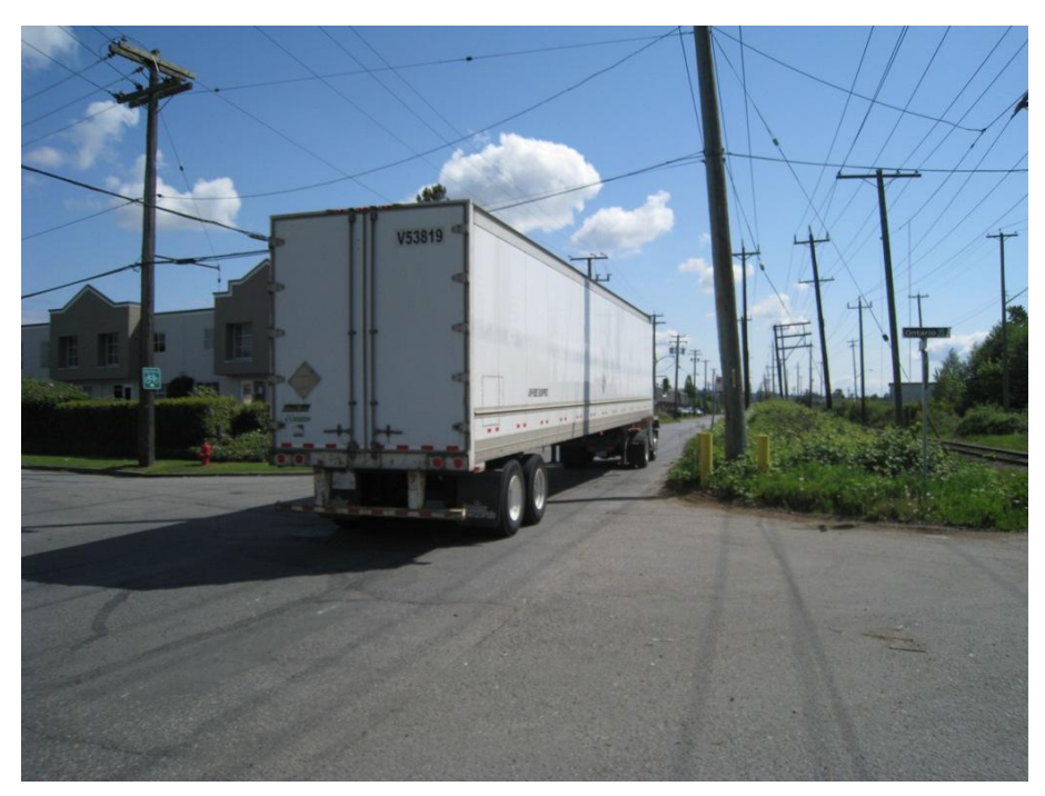
Figure 19 - Typical truck traffic overtaking people cycling along Kent Ave. North near Fraser St. Note the low traffic volumes due to the photo being taken on a Sunday morning.