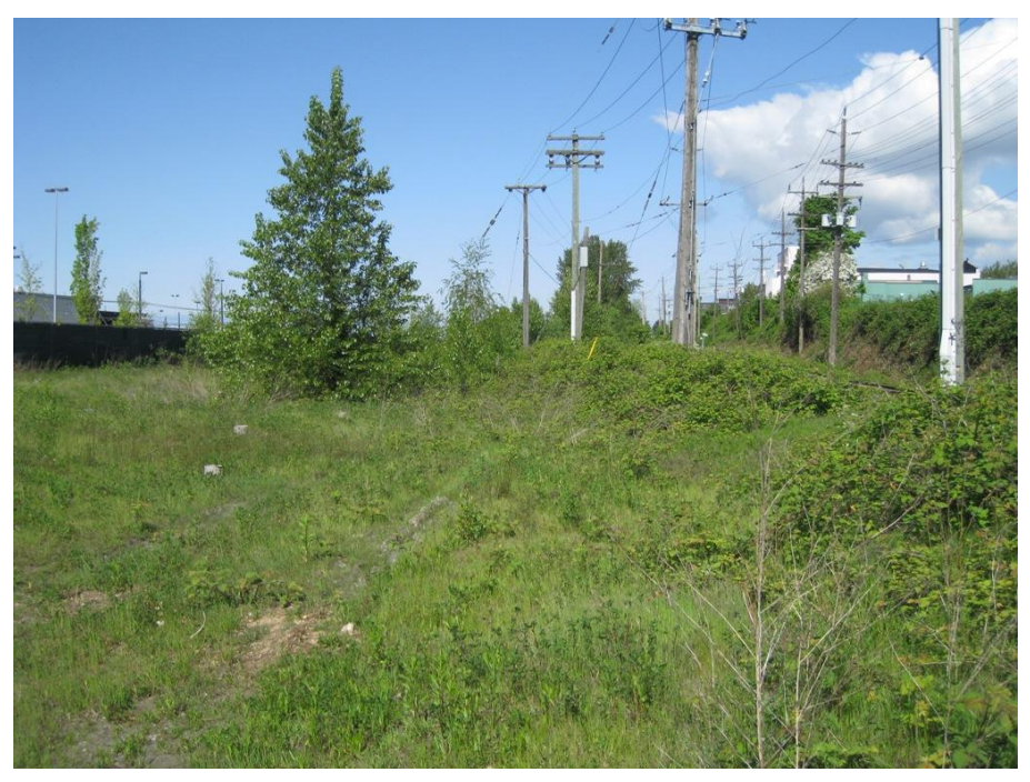
Figure 9 - The 75th Ave right of way, looking west from Hudson St