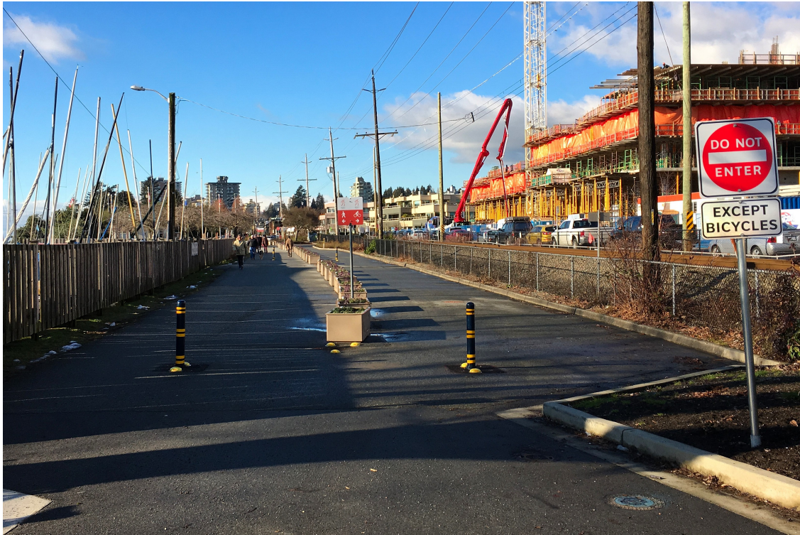
Looking west on the Spirit Trail in the 1300 block Argyle Avenue