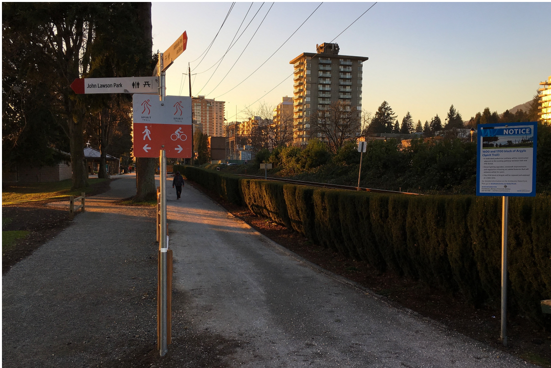
Looking west on the Spirit Trail in the 1600 block Argyle Avenue