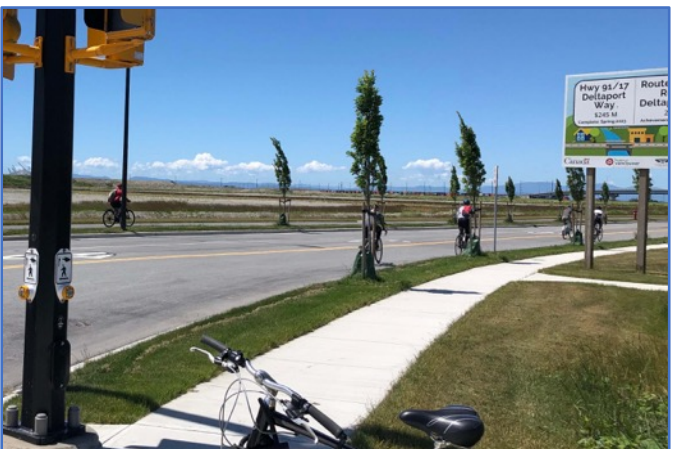
27 B Avenue at 41B St light