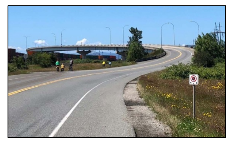
Deltaport Way looking west – service road goes under the Deltaport Way overpass

4. Another alternative. Use of substation dike access road, service road, Deltaport Way right-of-way. 41B St overpass and 27B Ave. (The substation can be seen in top left corner of picture on the left).