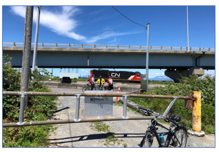
South of Deltaport Way on TFN Breakwater Path