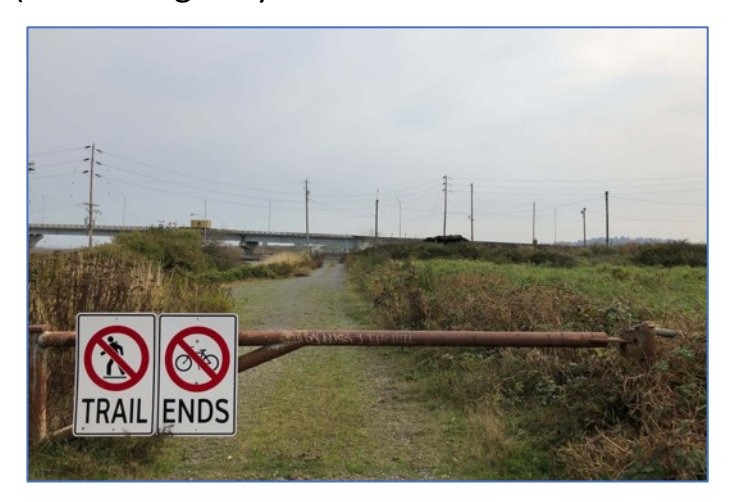
North of Deltaport Way on Brunswick Point Trail

BARRIER Deltaport Highway Transportation Corridor (rail and highway to the Vancouver Fraser Port Authority Delta Port).