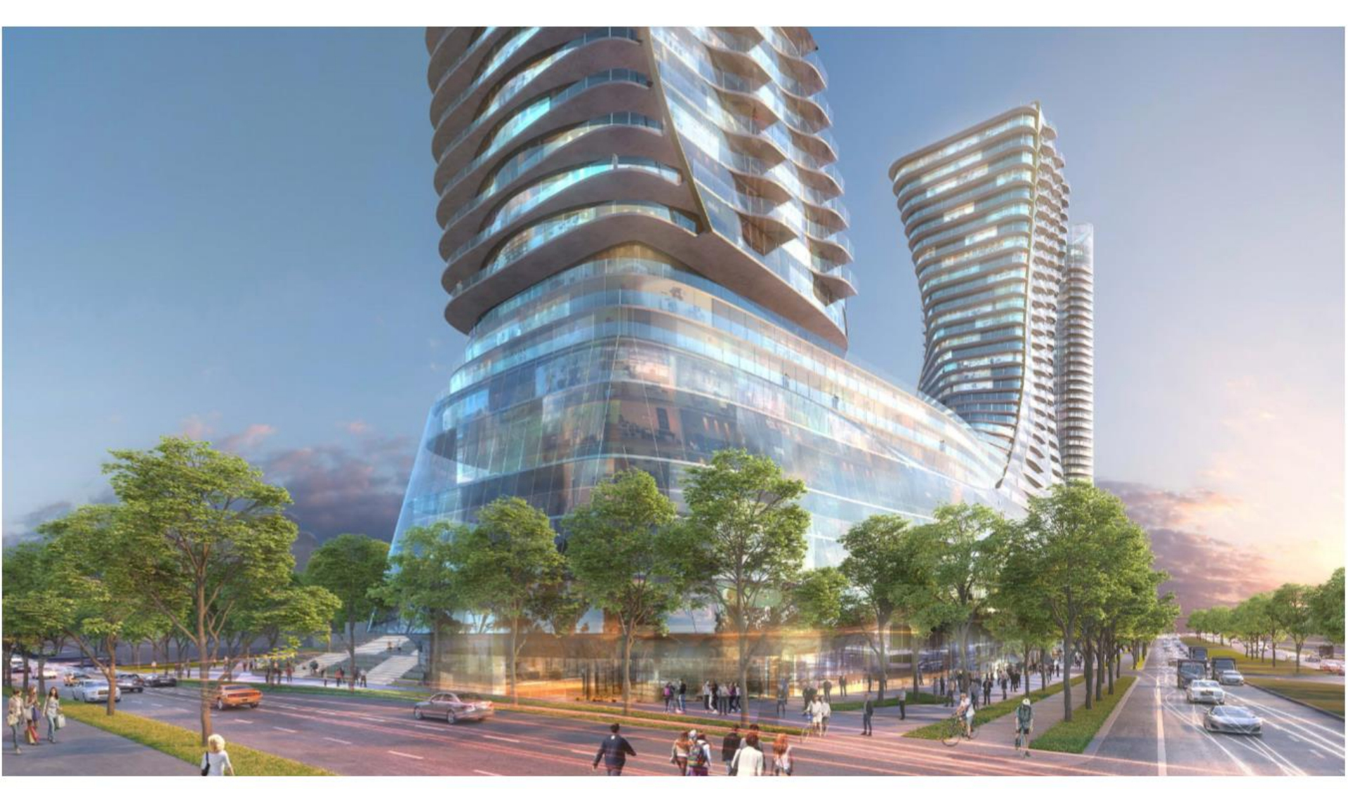
View from 45th Avenue looking Northwest