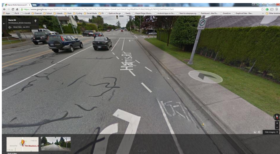
Google Streetview - Harris Rd Southbound at Hammond Rd