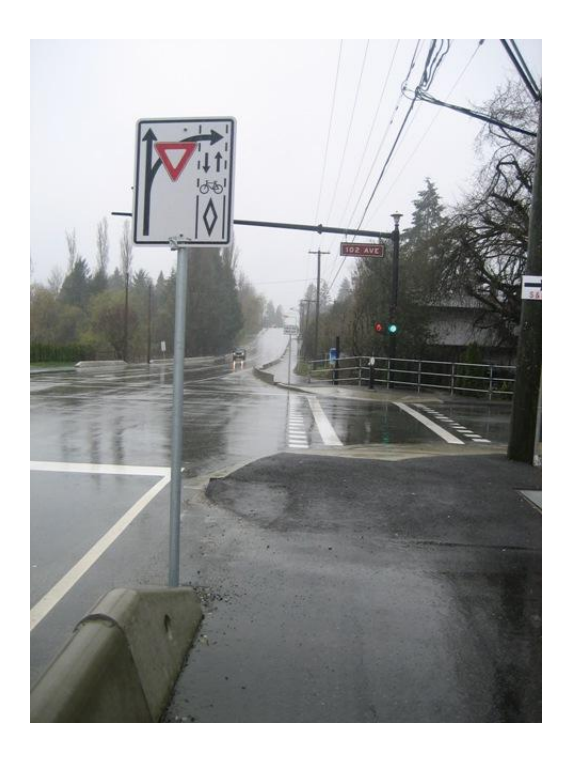
240th Street at 102nd Ave.