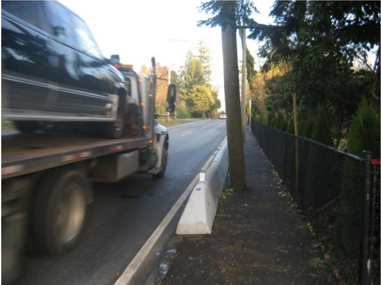
Pedestrian path on River Road, no shoulder for cycling

Note, however, that there is presently no cycling infrastructure at all south of Lougheed between 216 St. and 222 St./Haney Bypass. Cycling connectivity is non-existent. Apart from Lougheed Highway, the only through road is River Road. Both River Road and the south side of Lougheed Highway are very unsafe for cycling (in State of Cycling terms “comfortable for very few”).