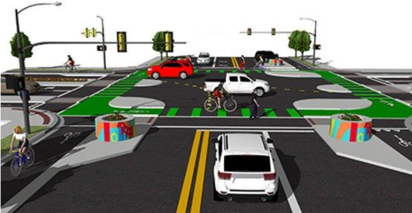
Protected intersection design for 27 th Street