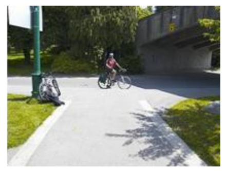
Going onto Stanley Park Road, bypassing the roundabout.

We appreciate the installation of map boards throughout the park as these make way finding easier. However way finding is still an issue for cyclists. Way finding signage indicating which paths are suitable for cycling would be a great enhancement.