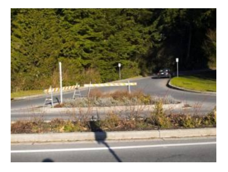
<-- The start of Lost Lagoon Drive at Second Beach; Here the road is somewhat narrower.

It would be an enhancement to be able to connect these points with a two-way bike path along Lost Lagoon Road. The current road is somewhat over-dimensioned for the amount of traffic (one lane used to be reserved for a bus), and is, except at Second Beach, wide enough. The best option would be to install a physical separation between bikes and motor vehicles..