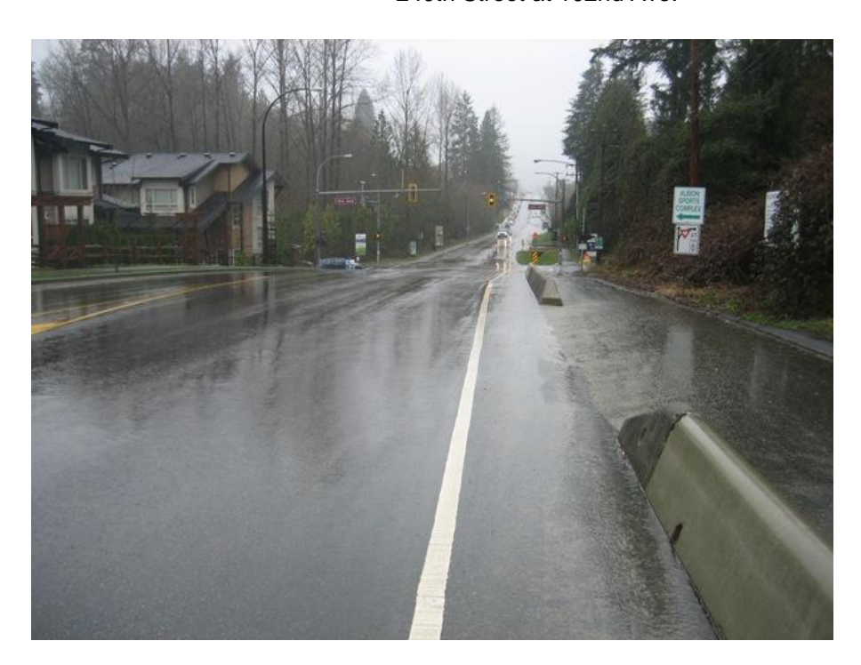
240th Street at 104th Ave.