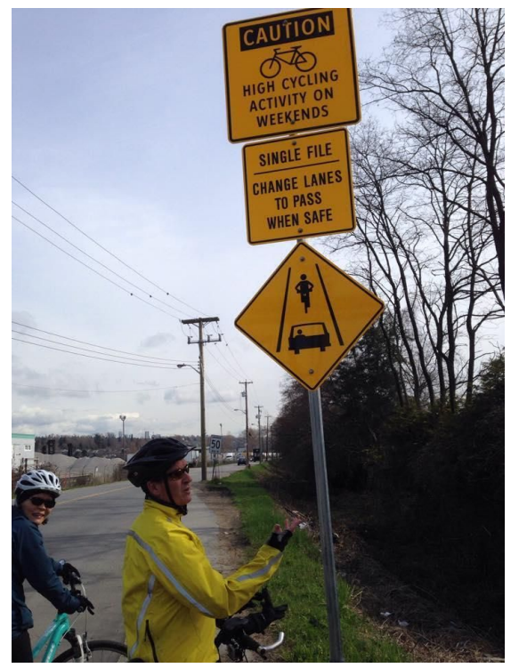
Figure 1. HUB Richmond supports "Single File Change Lanes to Pass When Safe" signage.

Our support for the road signage present during March 2018 refers specifically to the road signs that read: "SINGLE FILE CHANGE LANES TO PASS WHEN SAFE" (Figure 1).