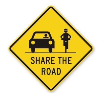
Figure 2. HUB Richmond / YVR Local Committee does not support SHARE THE ROAD signs on River Road. Road lanes on this road are not wide enough to allow motor vehicles to pass people cycling with at least 1.5 metres of space.

We consider SINGLE FILE signs to be a more accurate and safer road sign than "SHARE THE ROAD" signs (Figure 2) for the following reasons: