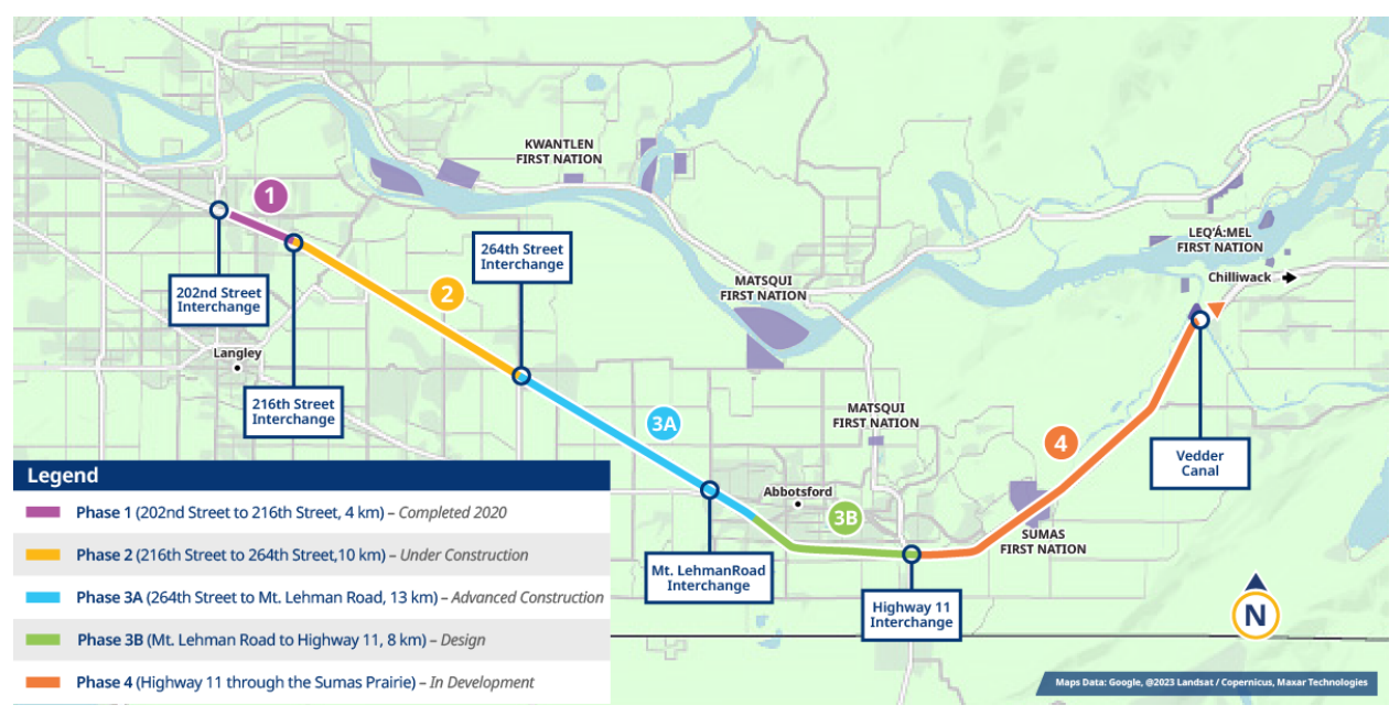
Figure 1: Proposed corridor improvements, including phase 3a, phase 3b and phase 2.

We note that Bike Fraser Valley has submitted <u>detailed recommendations for this project</u> and we concur with those recommendations.