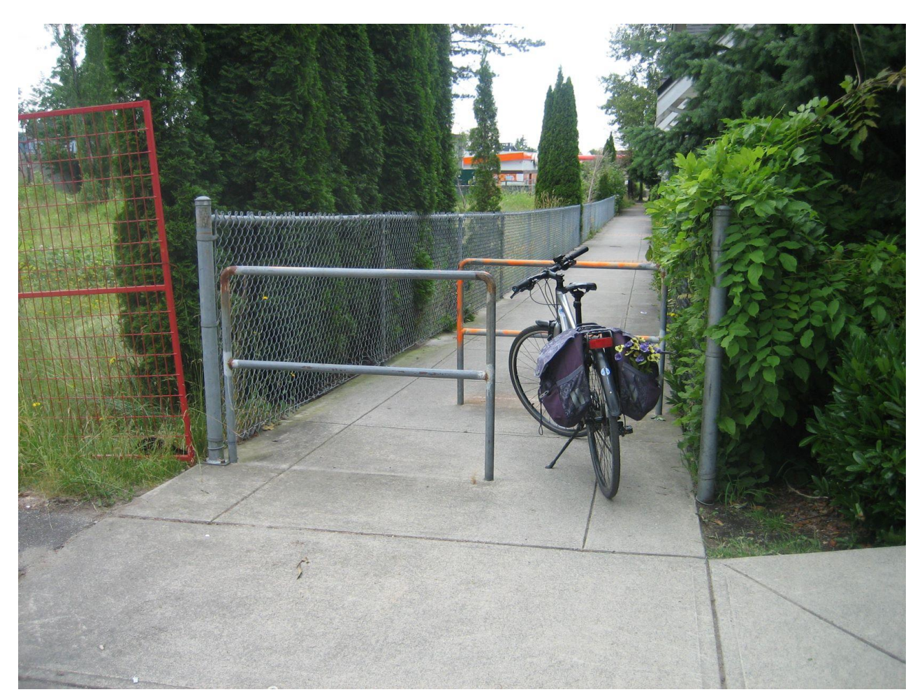
Example maze gate (pathway between Burnett and 228 St.)

With regard to the above development application, we would appreciate if the walkway that will be constructed on the north side of the site provides convenient and safe access not only for people walking but also for people cycling, whether on regular bikes, cargo bikes, adaptive bikes or bikes with trailers. Note that the maze gates that are typically used for these types of walkways are often difficult to navigate and can make pathways inaccessible for certain types of bikes.