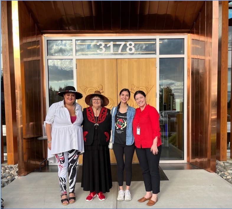
A GBHW presentation was made, by Grandmother and Granddaughter, to Tsleil-Waututh Chief and Council in June 2023