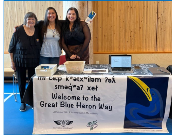
At the TFN Youth Job Fair