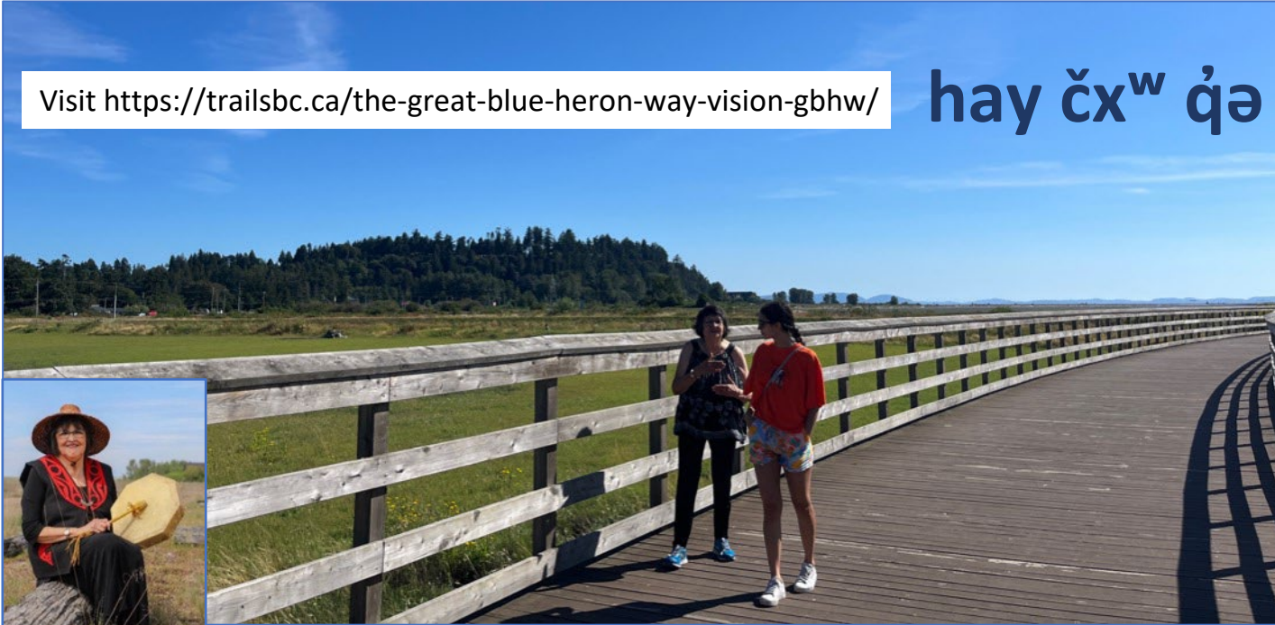
On the Great Blue Heron Way Boardwalk. Looking southwest towards Tsawwassen Bluffs, site of the Great Blue Heron rookery at Tsawwassen First Nation.