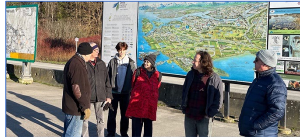
GBHW team members at the Hwy 17 pullout by the BC Ferries causeway