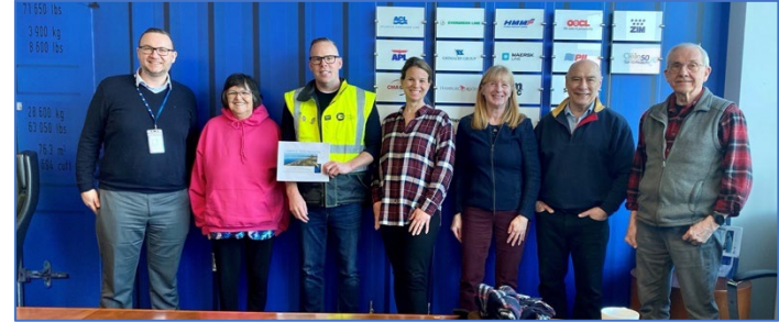
GBHW team members with supporters, Global Container Terminals