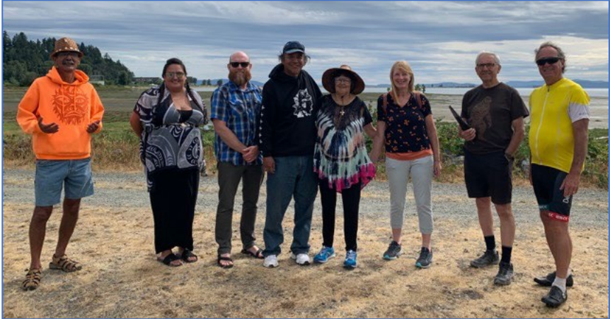
On the Great Blue Heron Way at TFN with Squamish Nation members and GBHW volunteer team members, 2021