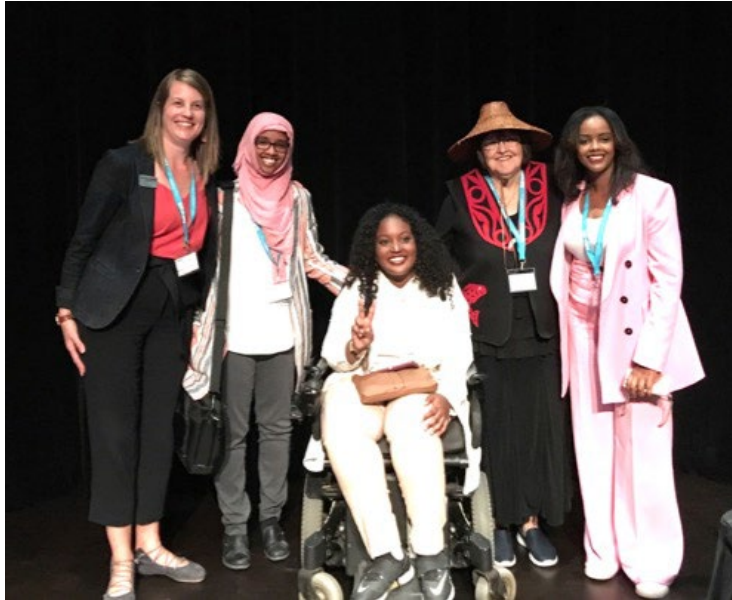
Inclusive Active Transportation panelists, 2019.

Regional GBHW presentations have taken place at: