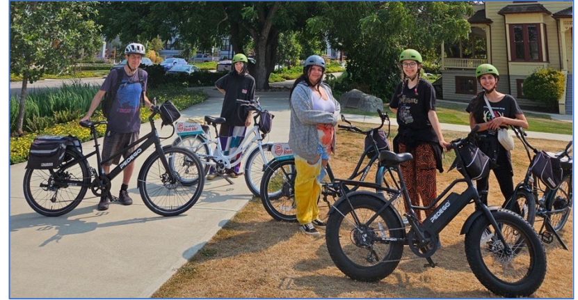
TFN Summer Youth Program - 2022 on TFN, and 2023 at Boundary Bay