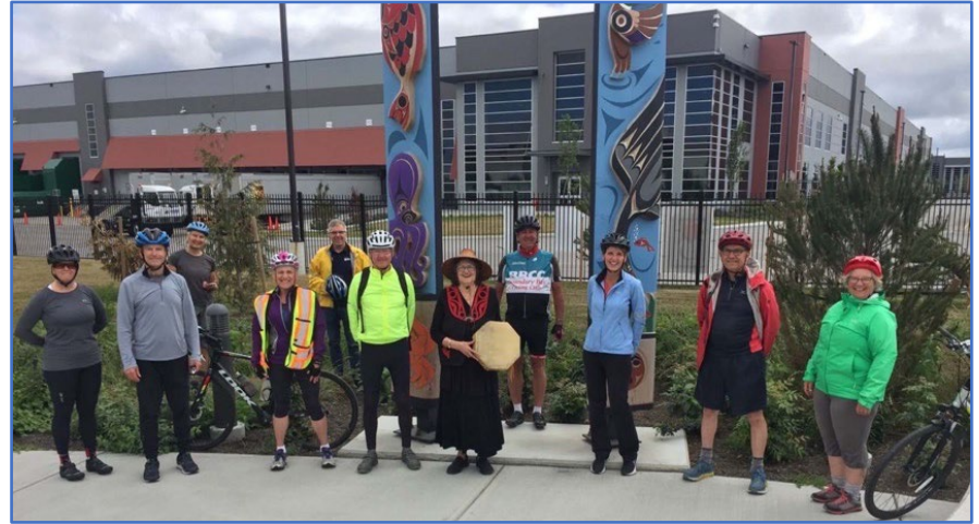
Start of bike tour, with Trails BC and HUB Cycling.

Working closely with supporting organizations