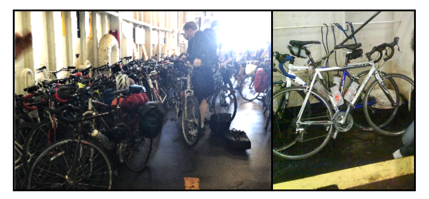
Figure 1 . Many of BC Ferries' current fleet does not include parking for passengers with bicycles. Left: MV Queen of Nanaimo , Summer 2017.

HUB Cycling encourages ample and quality bike racks on the next generation of BC Ferries' fleet. Many current vessels have inadequate, or no bicycle racks which disincentivizes cycling because of a concern of damage or theft to passengers' bike or bike parts. Figure 1 demonstrates some of the lack of infrastructure where bicycles are simply leaned against the wall or each other, which is neither secure against theft nor stable, and makes unloading frustrating and inefficient for all passengers.