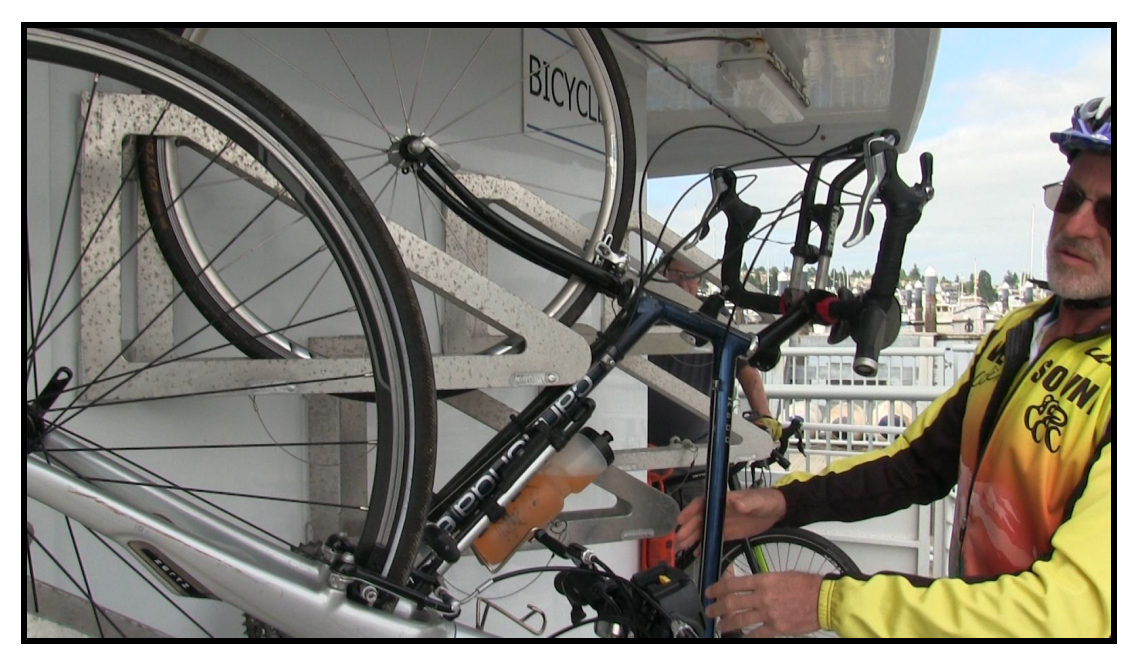
Figure 3 . Vertical racks work well if space is limited but are less accessible than horizontal designs.

Where horizontal space is a design concern in the next generation of ferries, a further space efficient design is used by the Seattle-Bremerton ferry (see Figure 3). Due to the accessibility concerns of using vertical racks, HUB Cycling recommends allocating a maximum of 30% of on-board bicycle storage for this type of design.