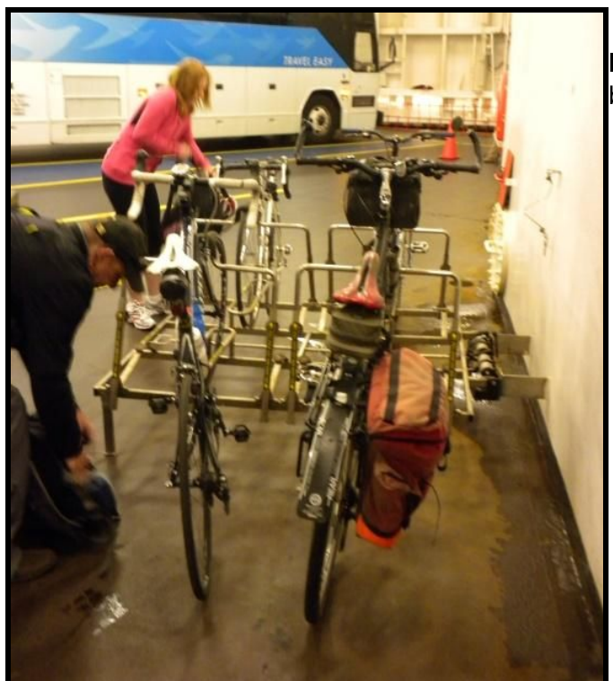
Figure 2. Retractable bicycle racks can be folded up when not in use.

Where horizontal space is a design concern in the next generation of ferries, a further space efficient design is used by the Seattle-Bremerton ferry (see Figure 3). Due to the accessibility concerns of using vertical racks, HUB Cycling recommends allocating a maximum of 30% of on-board bicycle storage for this type of design.