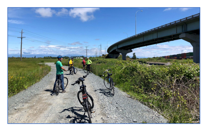
Photo: The service road on the north side of the Deltaport Way and rail lines, looking east, June 2020.

All options will require the service road upgrade.