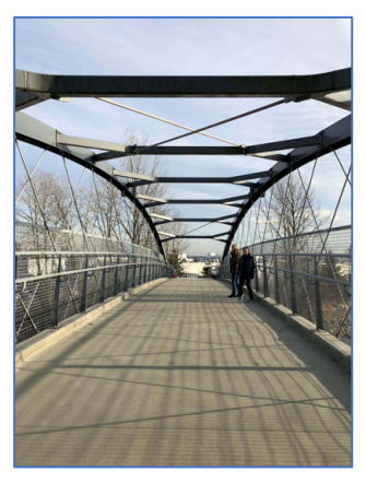
Photos. Spirit Trail pedestrian / bike bridge, North Vancouver, Feb. 2020